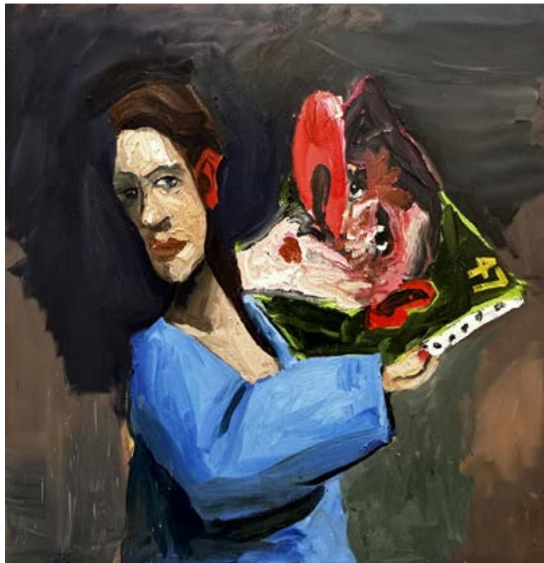
Untitled 2019 oil on linen 107 x 107 cm $10,000