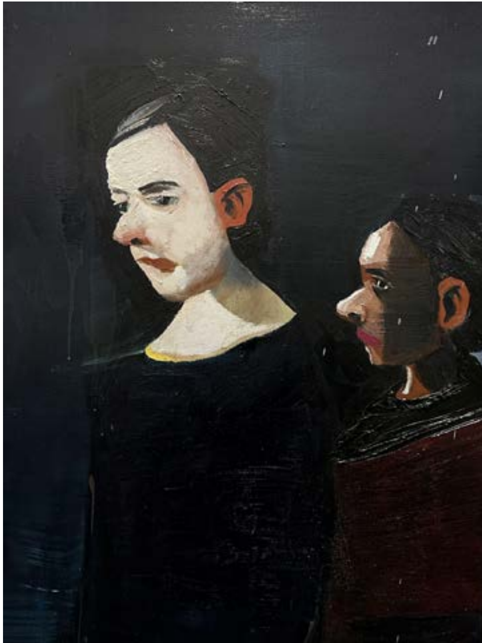
Warwick in Limbo 2020 oil on canvas 112 x 87 cm $10,000