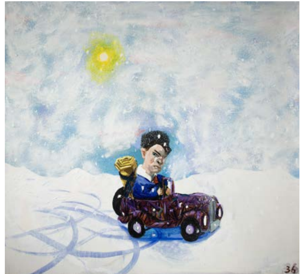
Arctic Traveller 2009 oil on canvas 133 x 183 cm NFS