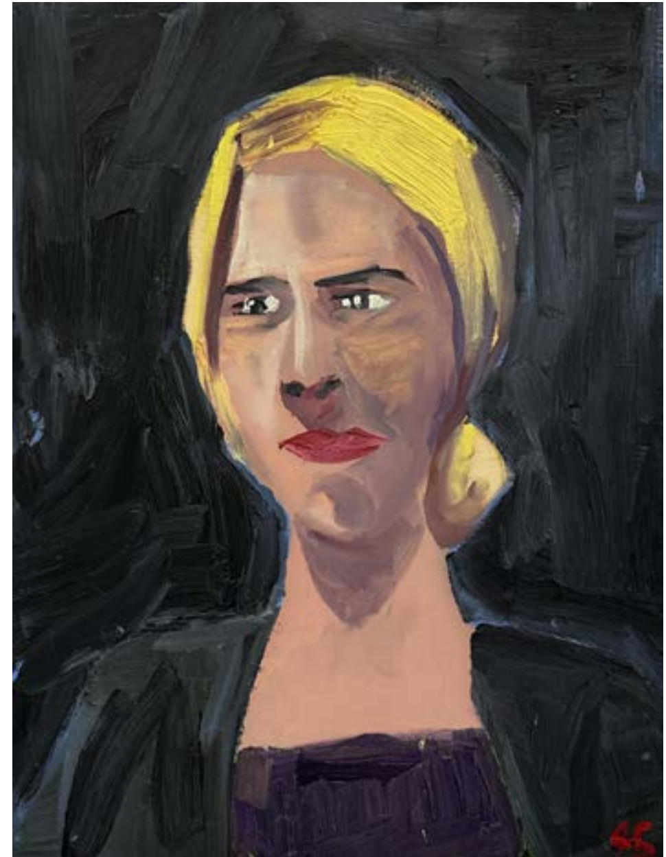
The Cellist 2017 oil on board 61 x 47 cm $2,800