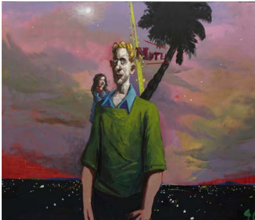
LA Story #2 2012 oil on Linen 183 x 213 cm NFS