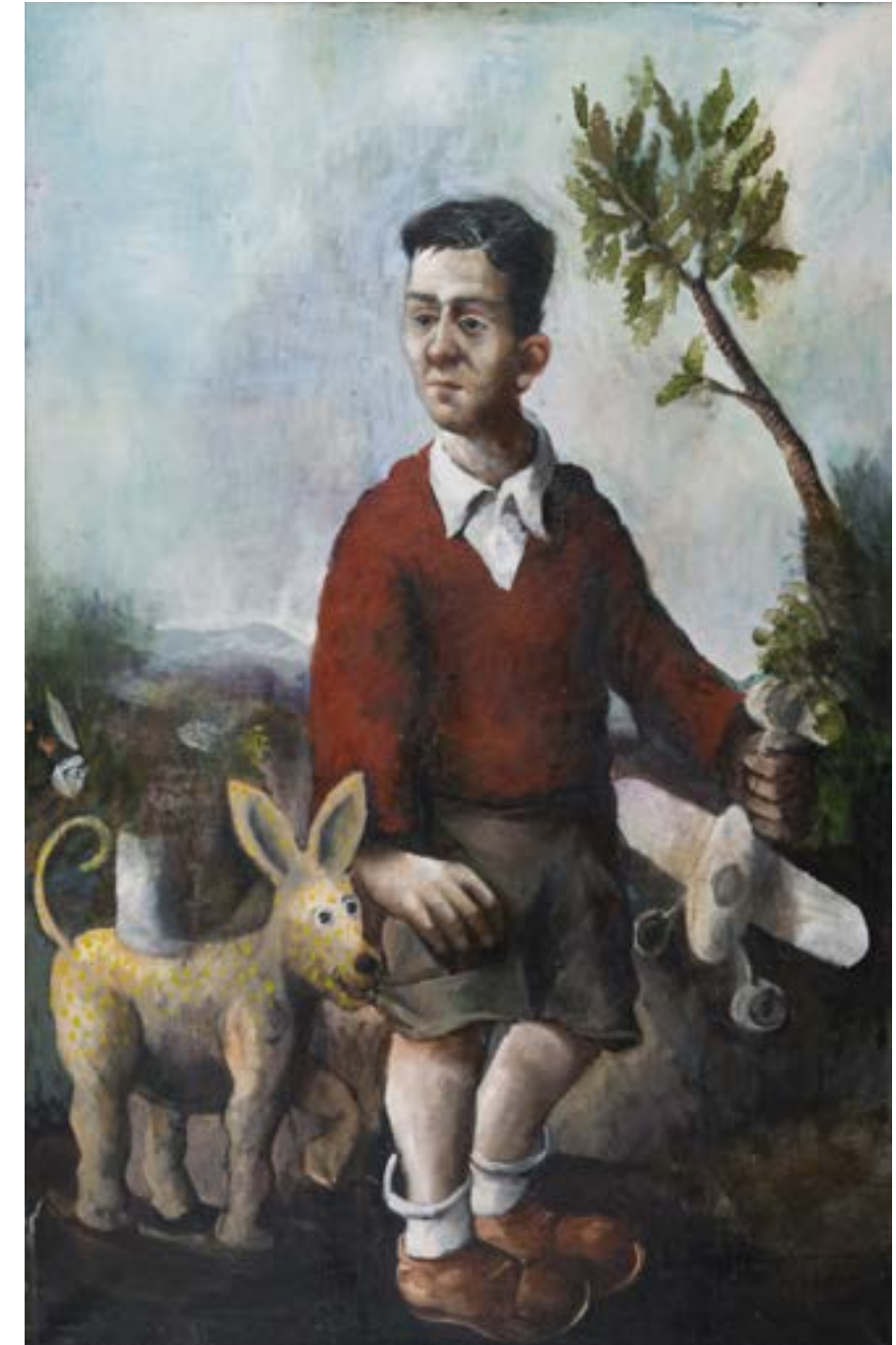
Portrait 1996 oil on canvas 140 x 91 cm NFS