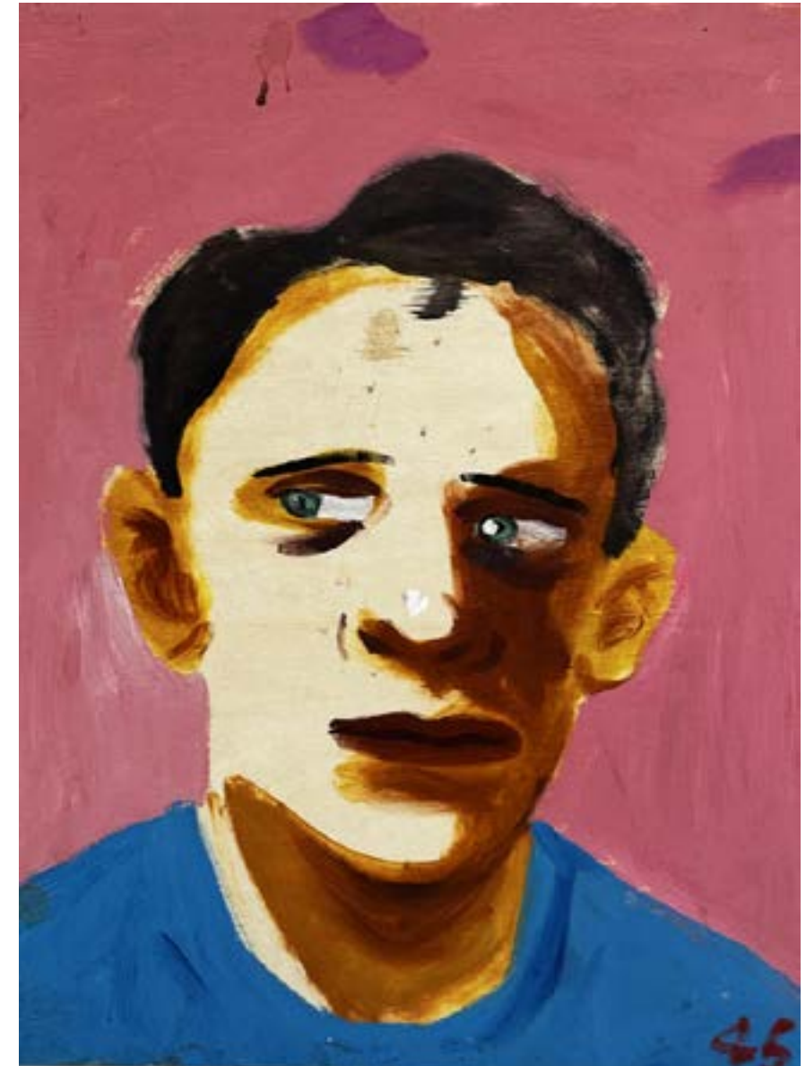
The Instructor 2017 oil on board 51 x 41 cm $2,400