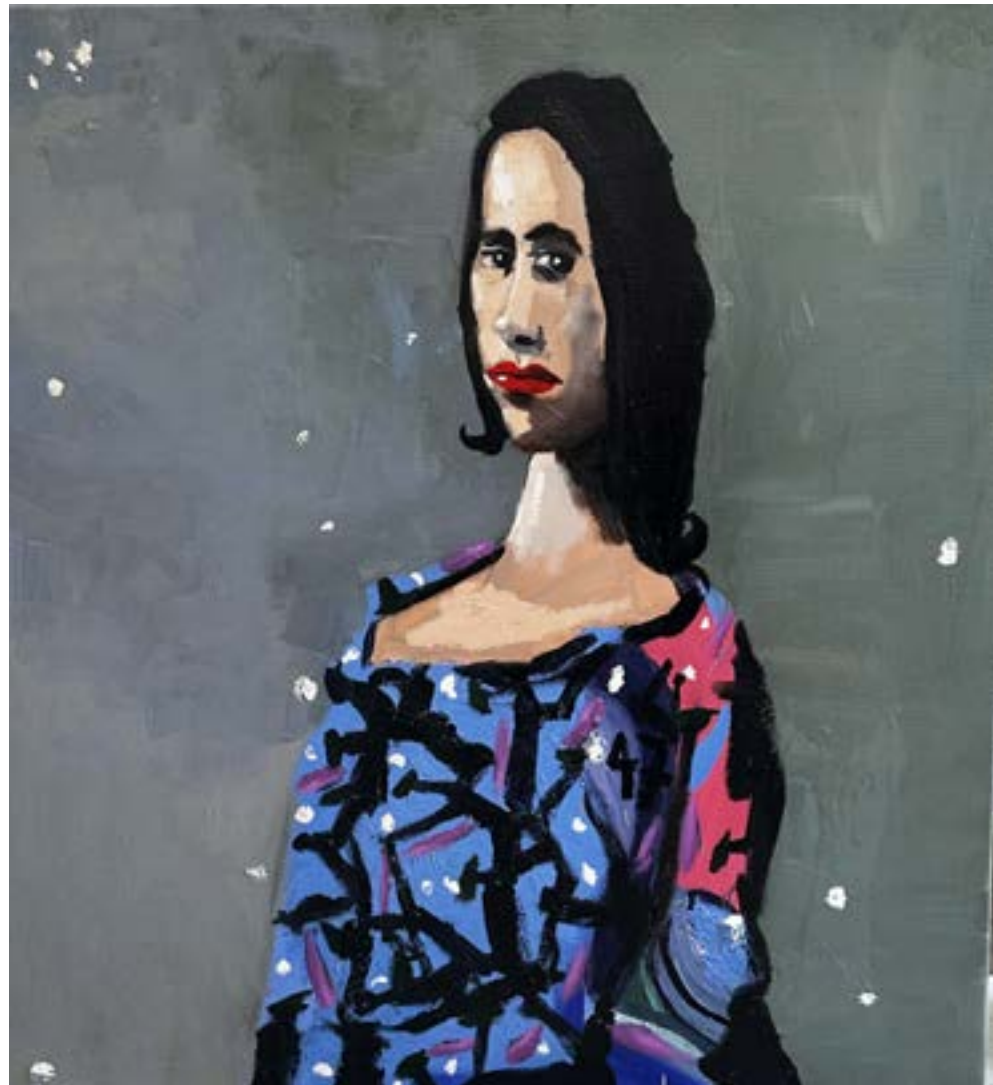
Untitled 2019 oil on canvas 102 x 102 cm $10,000