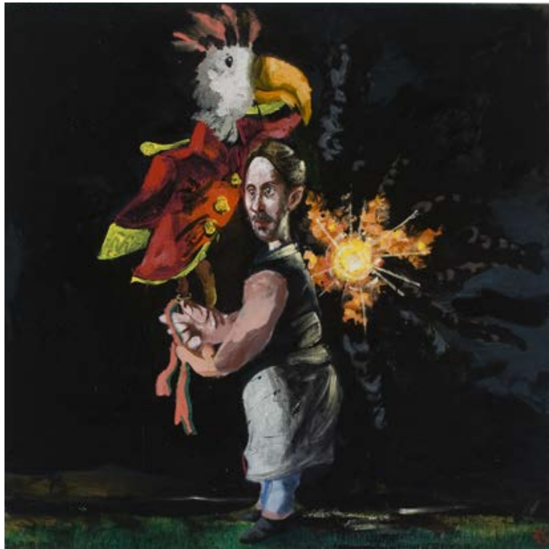
Indiscrete 2007 oil on canvas 152 x 152 cm NFS