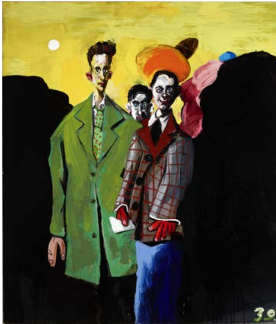
The Journalist 2012 oil on canvas 213 x 183 cm NFS