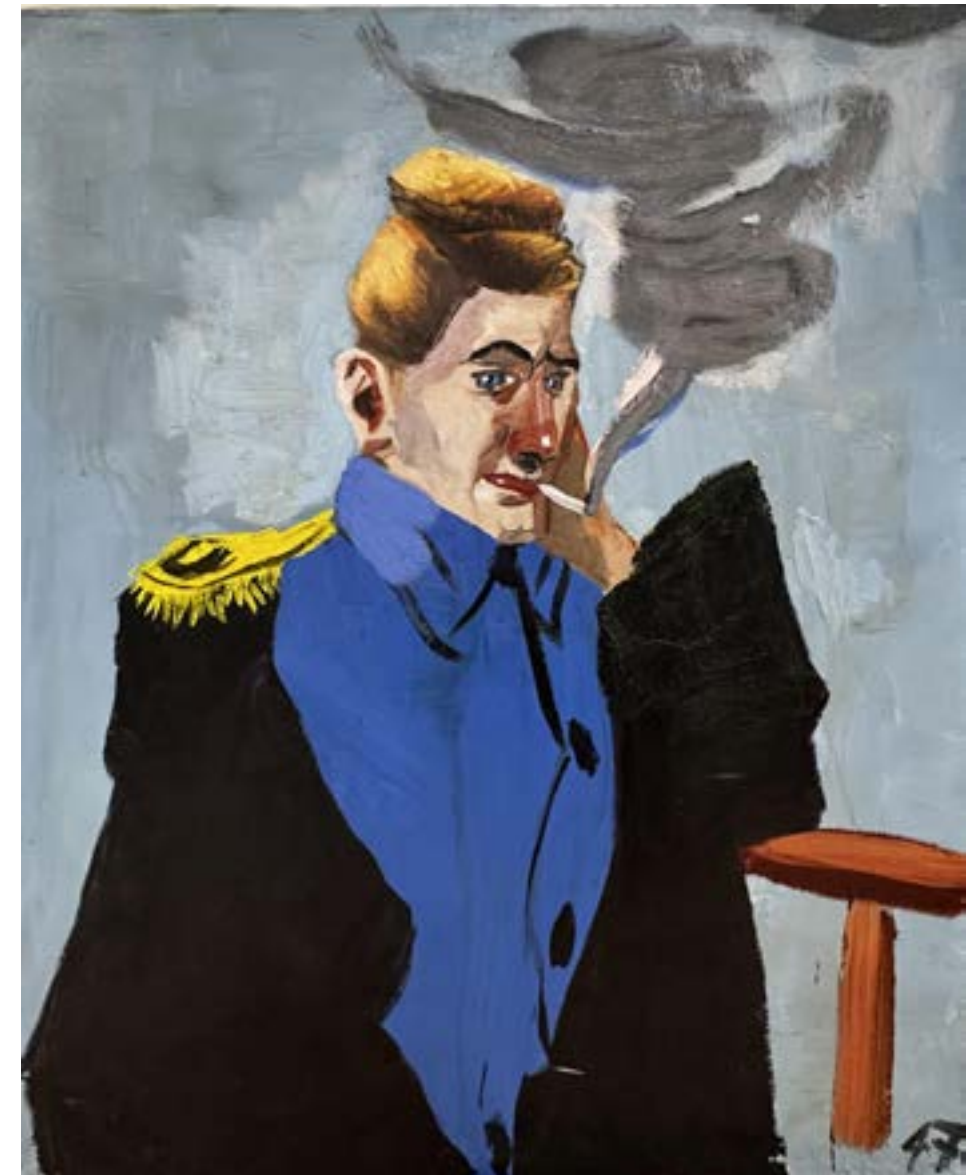
The Adelaide Writer 2020 oil on canvas 120 x 100 cm $12,000