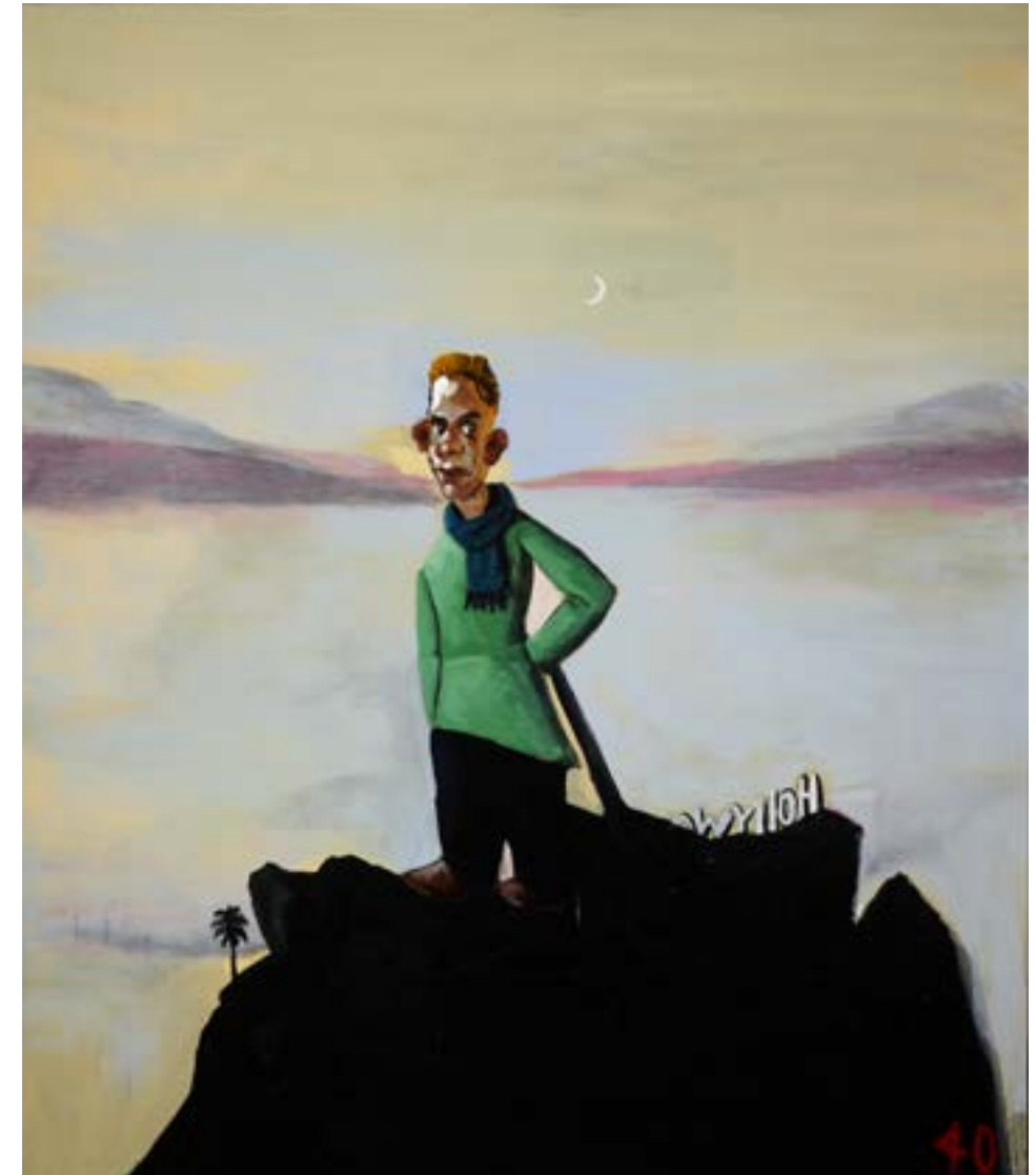
LA Story #3 (Black List) 2012 oil on Linen 183 x 213 cm NFS