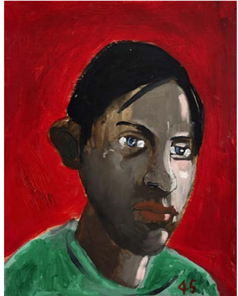
The Student #2 2017 oil on board 51 x 41 cm $2,400