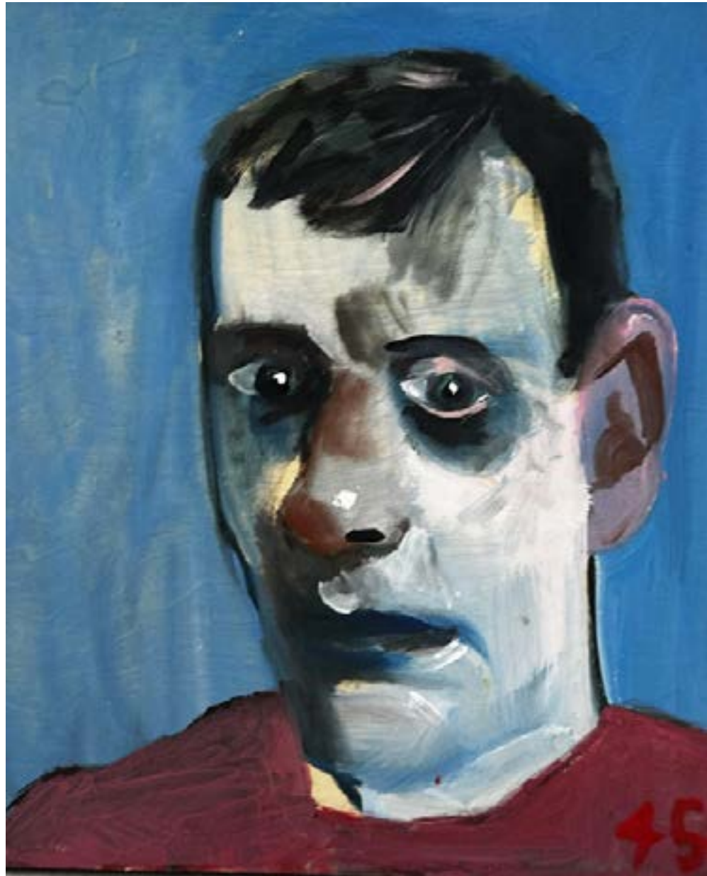
The Framer 2017 oil on board 51 x 41 cm $2,400