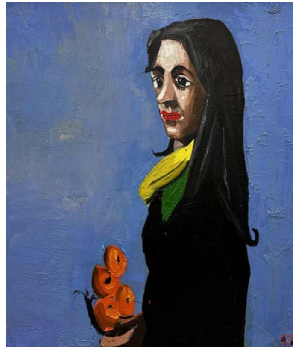
Portrait of a girl with Black Hair 2019 oil on canvas 120 x 100 cm $12,000