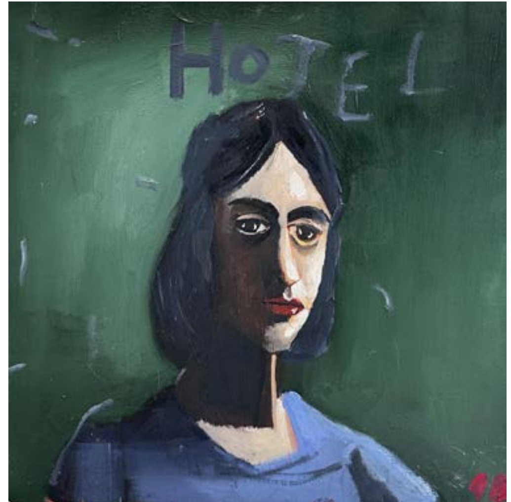
Untitled (Hotel) 2020 oil on linen 72 x 72 cm $5,500