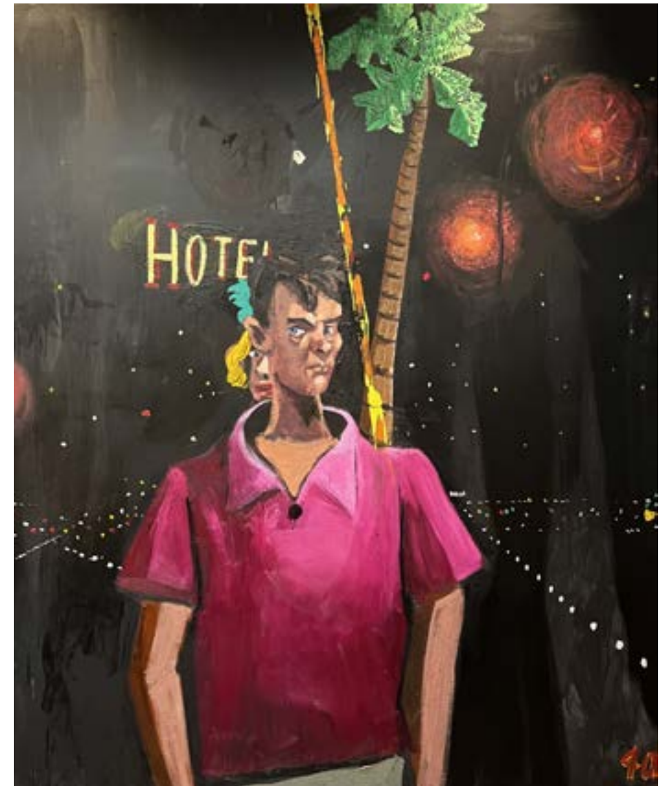
LA Story 2012 oil on canvas 213 x 183 cm NFS