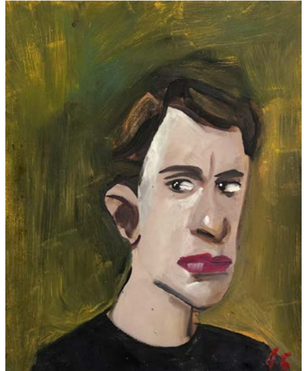
The Waiter 2017 oil on board 51 x 41 cm $2,400