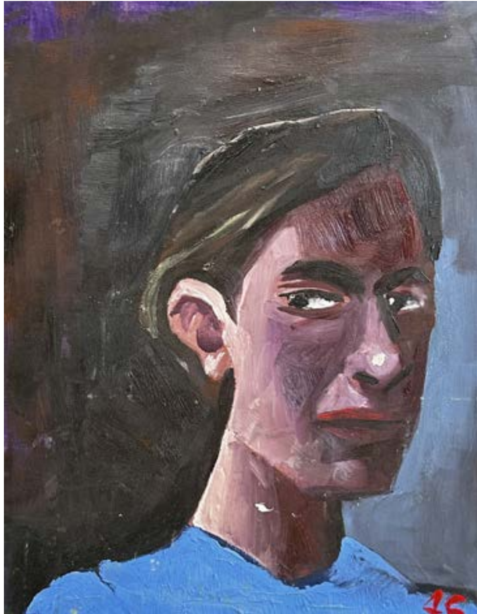
The Night Manager 2017 oil on board 51 x 41 cm $2,400