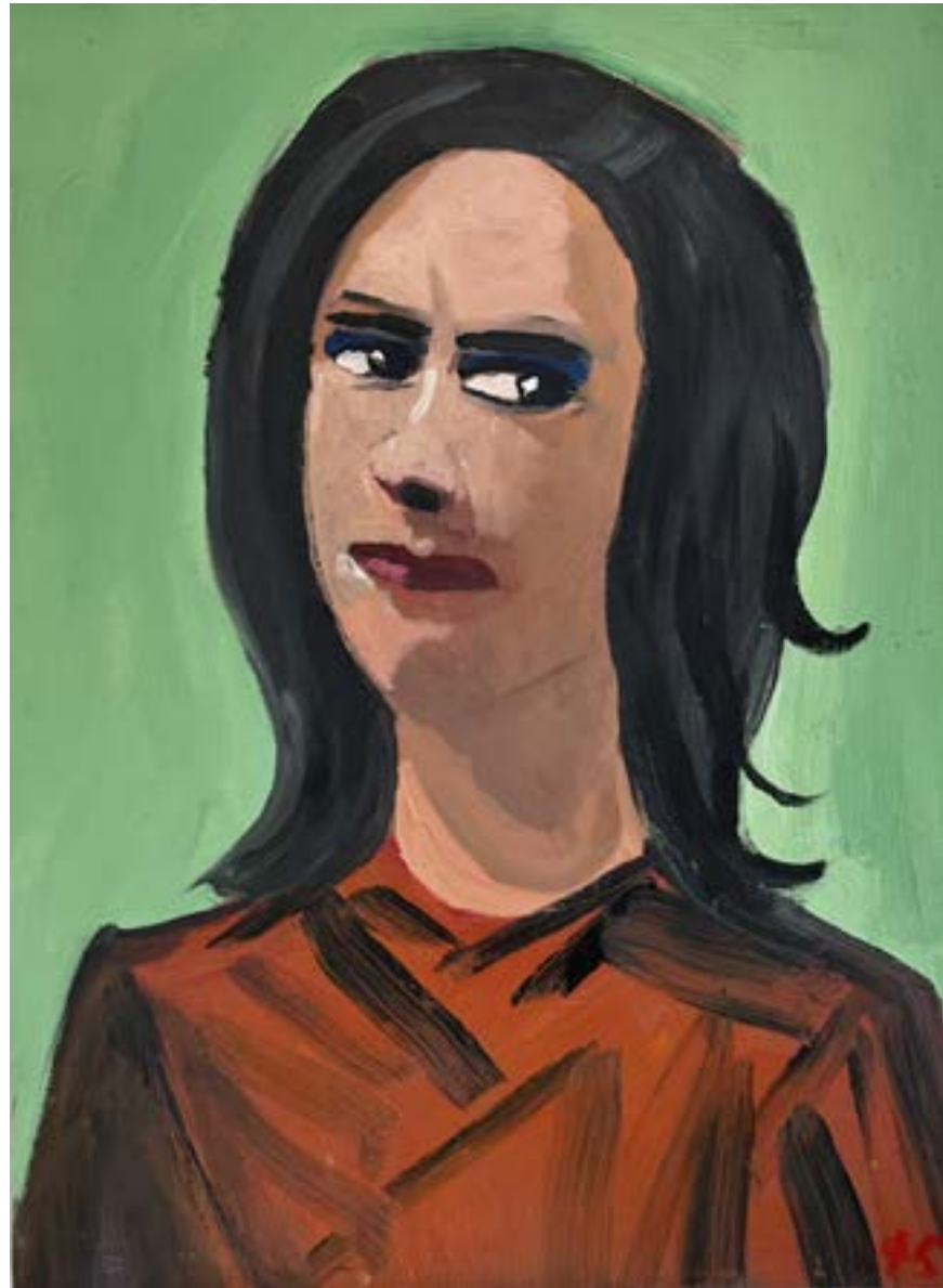
The Paralegal 2017 oil on board 61 x 47 cm $2,800