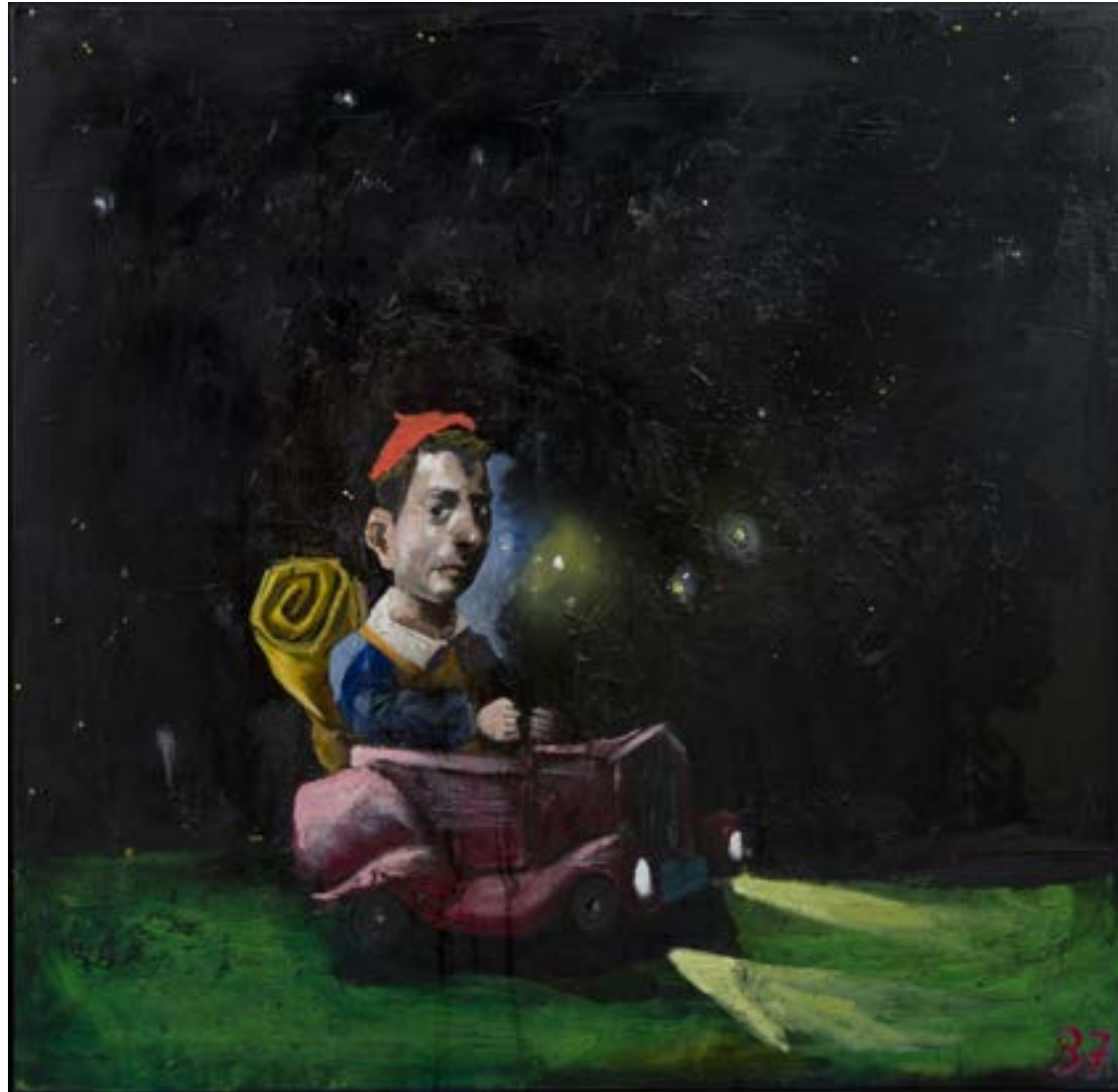
Riding 2009 oil on canvas 153 x 153 cm NFS