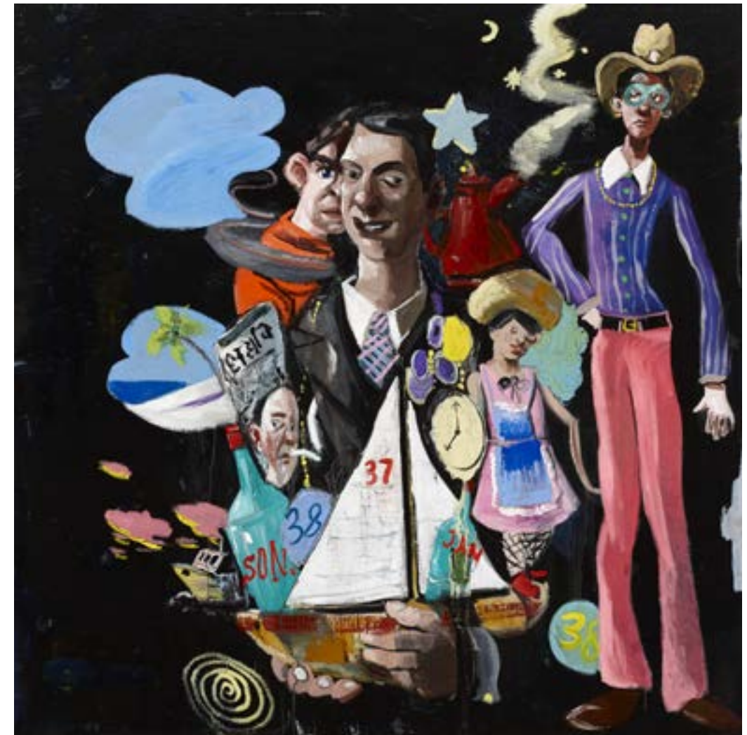
Disco Boat 2010 oil on canvas 152 x 152 cm NFS