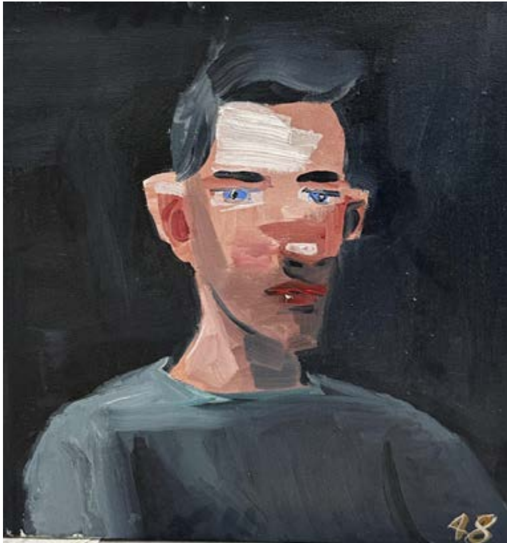
Portrait of Peter in French Paints 2020 oil on linen 61 x 61 cm $4,500