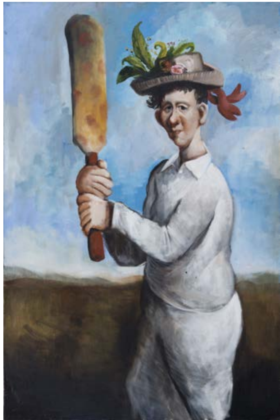
Bruises 1996 oil on canvas 121 x 81 cm NFS