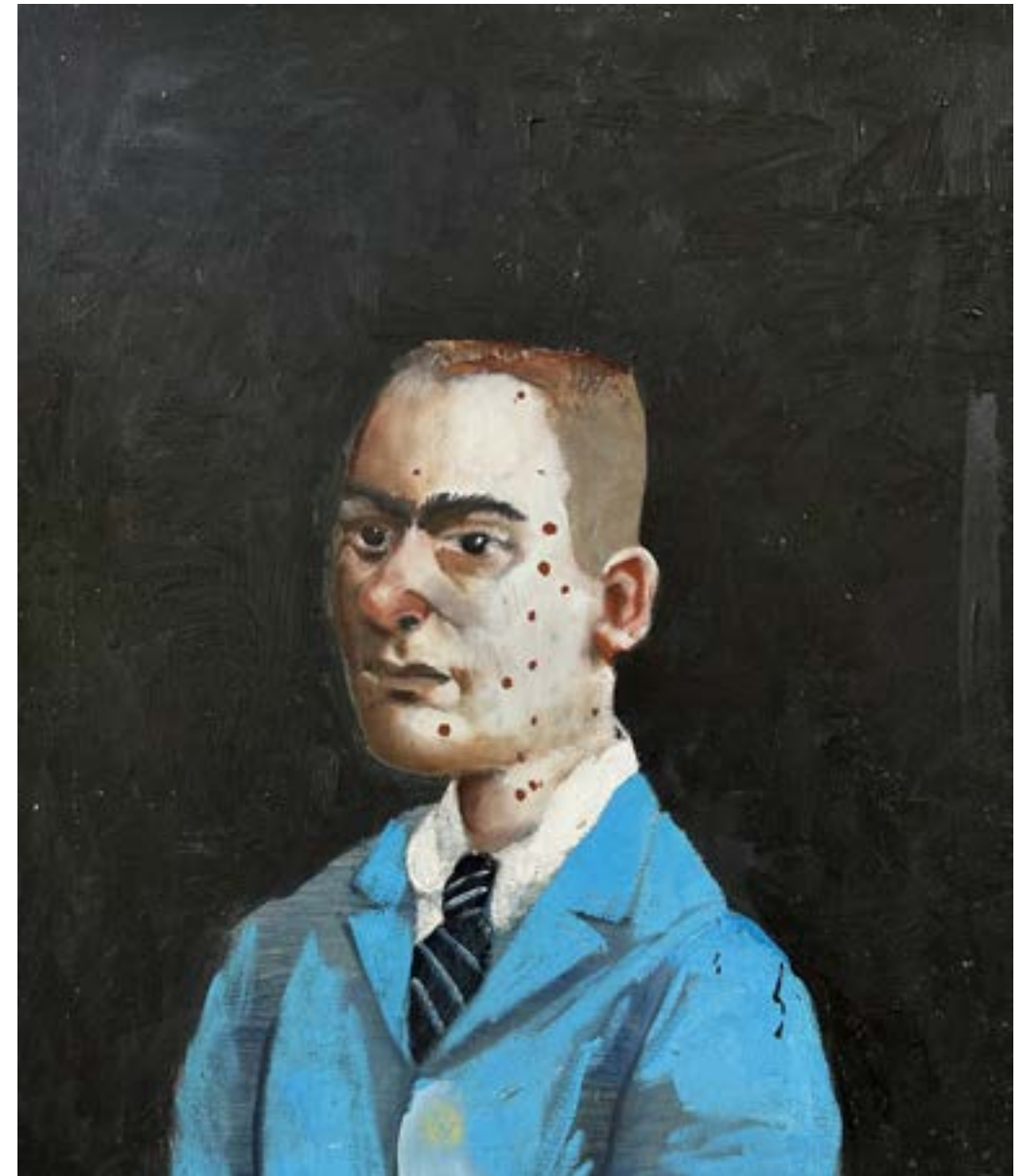
School Boy 2000 oil on canvas 70 x 60 cm NFS