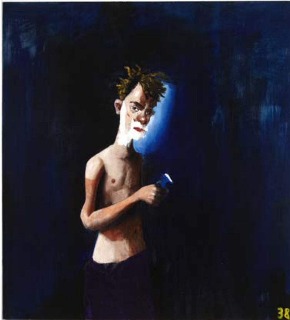
Shaver, Self Portrait 2010 oil on canvas 183 x 183 cm NFS