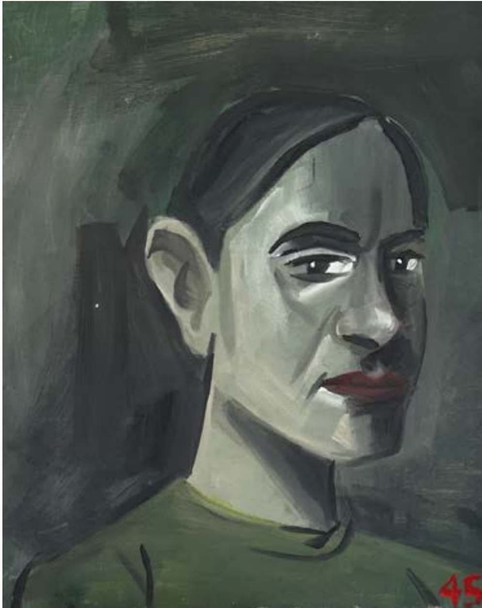
The Actor #2 2017 oil on board 51 x 41 cm $2,400