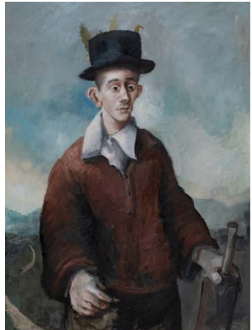
The Cricketer 1996 oil on canvas 102 x 76 cm NFS