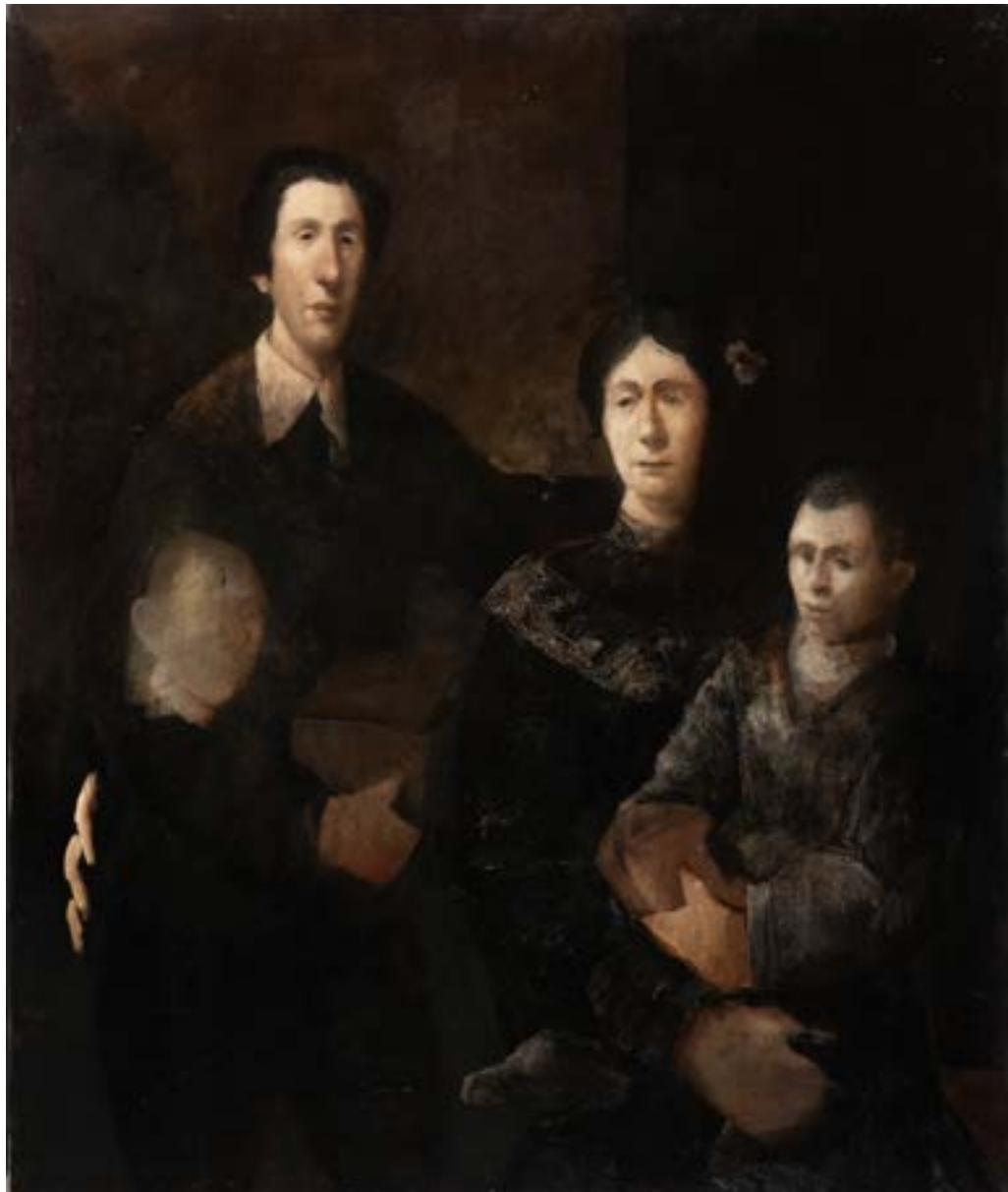
Ghost Family 1994 oil on canvas 122 x 102 cm NFS