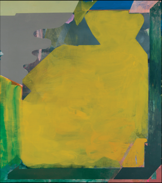
Cover Everyday Play 2017 Oil and acrylic on linen 225 x 185cm