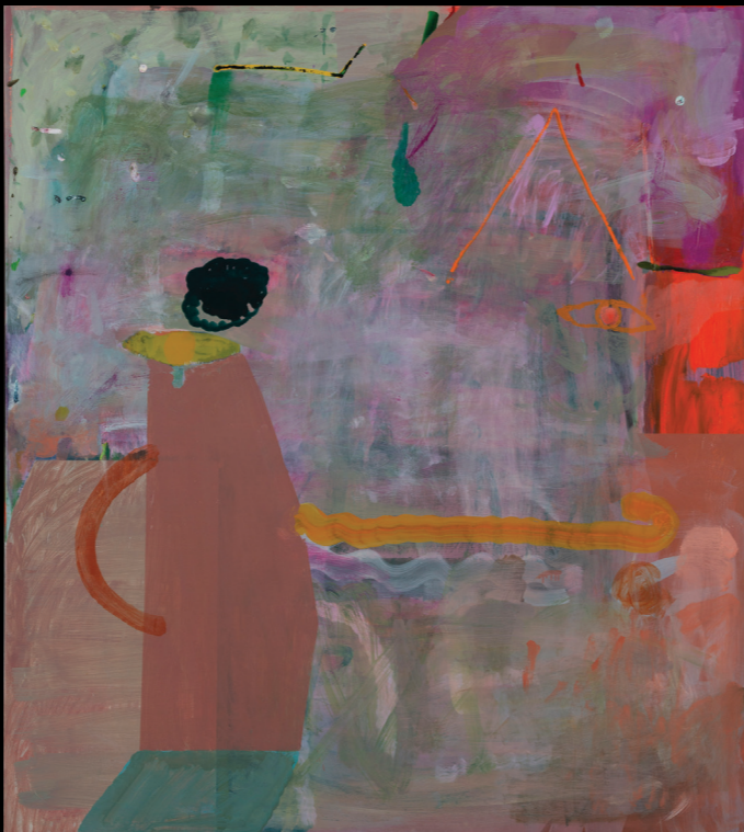
Above Bit - a - This, Bit - a - That 2018 - 2019 Oil on linen 156 x 140cm