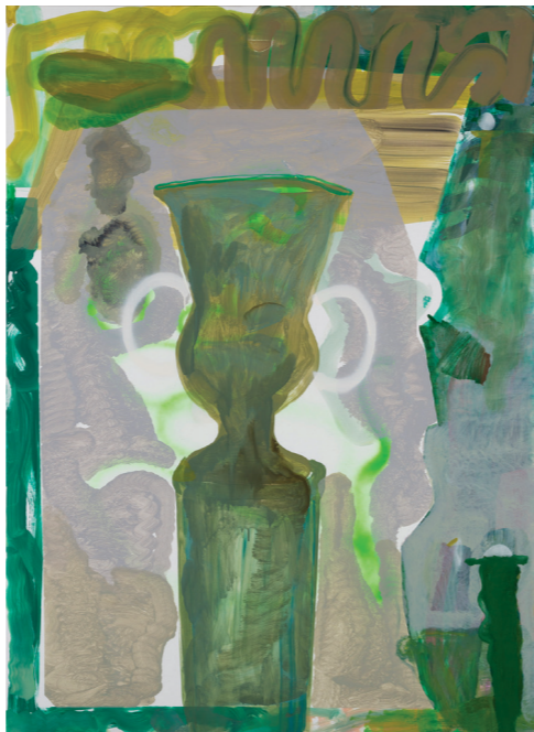
Left Fundamental/Archetypal 2019 Oil on linen 168 x 122cm