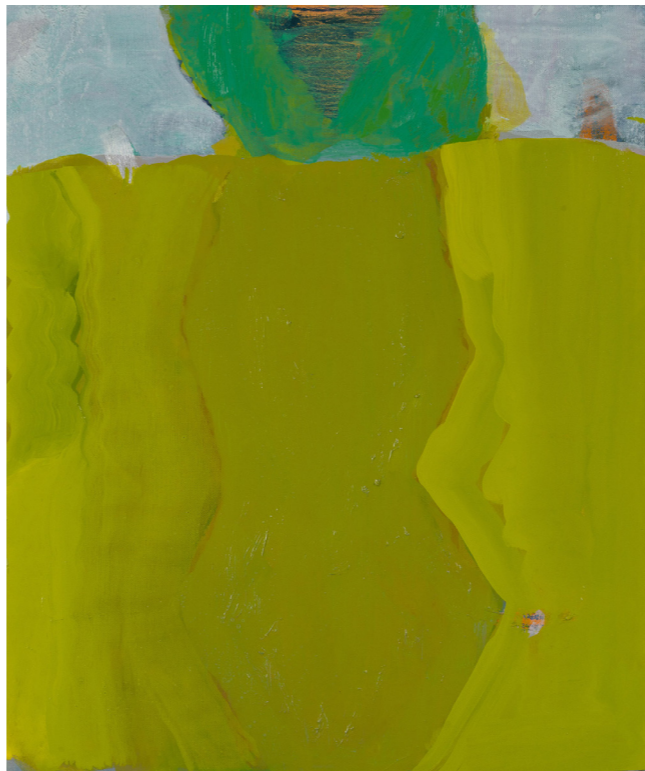
Right Suggesting Icons II 2019 Oil on linen 64 x 54cm

Artworks courtesy of Miranda Skoczek Miranda Skoczek appears courtesy of Nicholas Thompson Gallery, Melbourne and Edwina Corlette Gallery, Brisbane