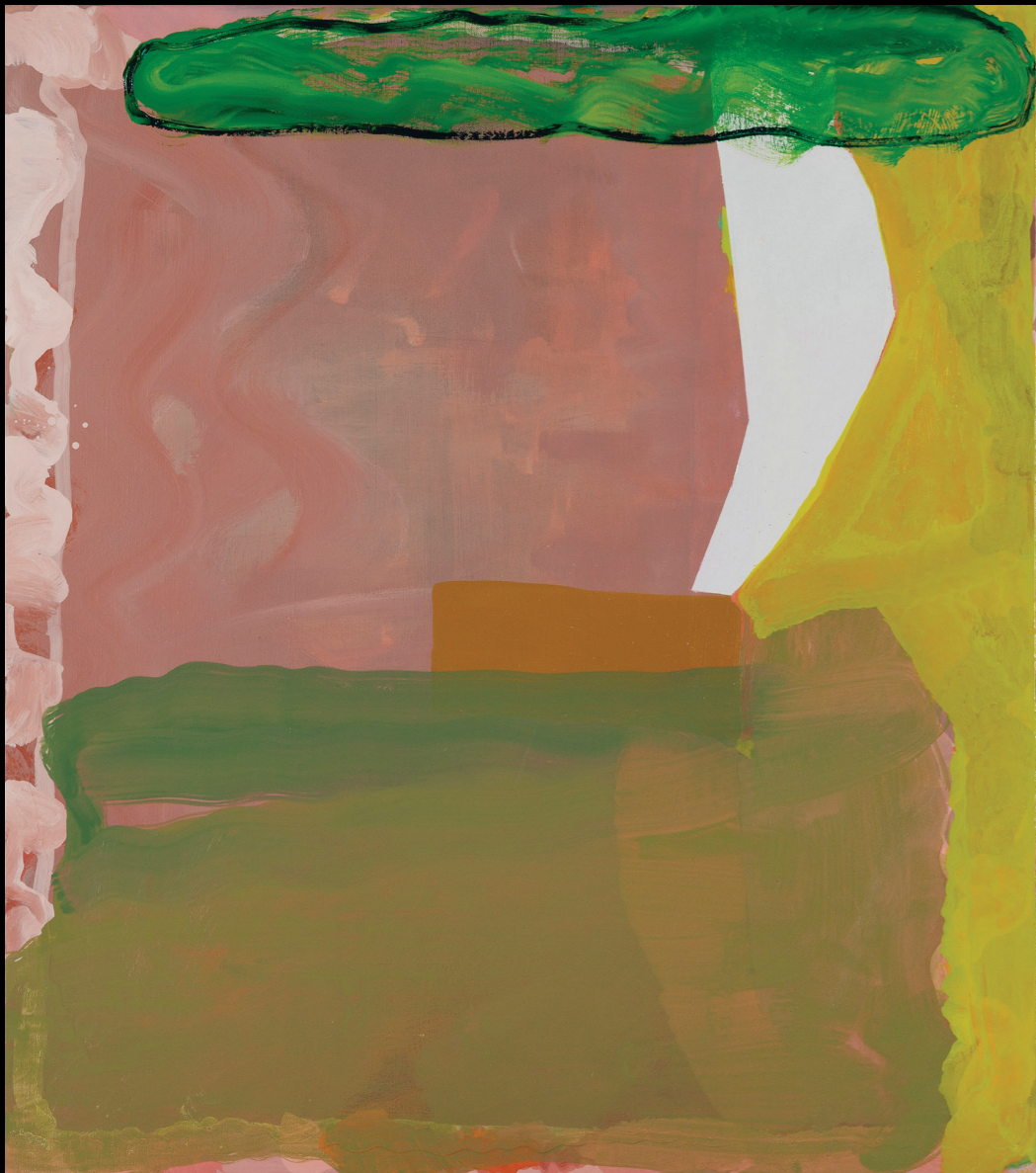
Above Irregular Flashes 2018 - 2019 Oil and acrylic on linen 86 x 76cm