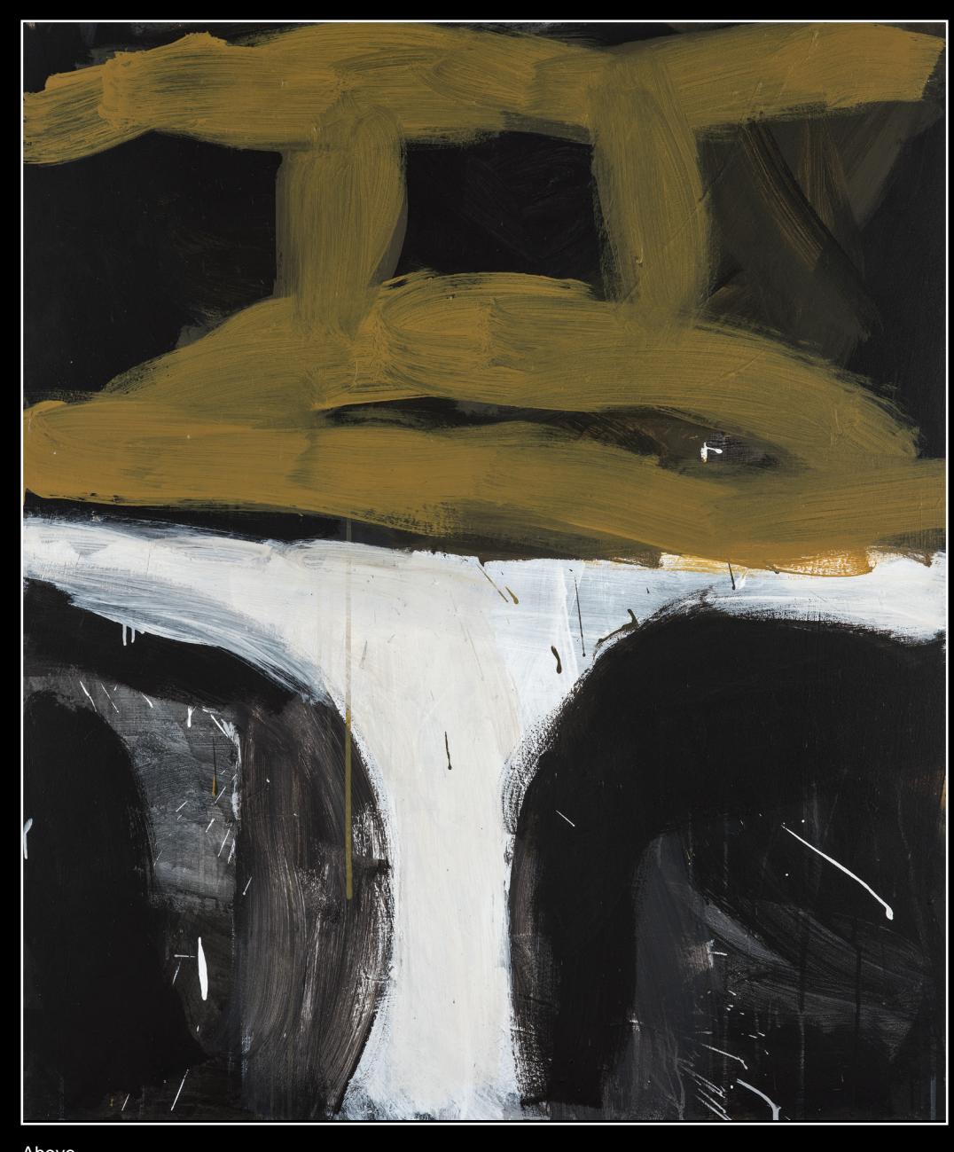
Above I Didn't Stop Until It Ended But It Never Did So I Never Did 2018 Acrylic on board 122 x 104cm