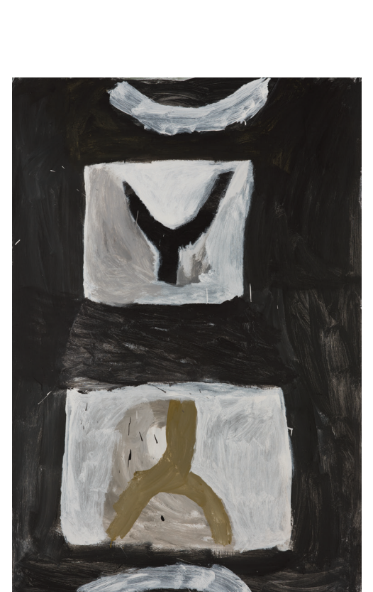
The Clayton Utz Art Partnership

The Clayton Utz Art Partnership brings together a unique collaboration between two outstanding Australian artists and our firm.