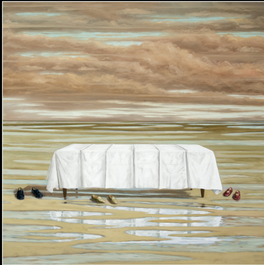
Above Water table 2018 oil on canvas 154 x 152 cm