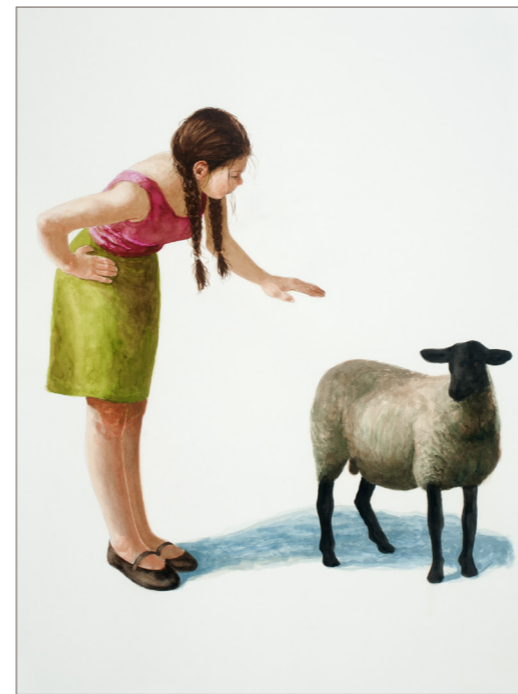
Right Ministrators of the shepherdess 2015 watercolour and gouache on paper 76 x 57cm