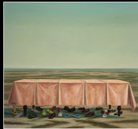
Cover The faith healer 2016 oil on canvas 152 x 137 cm