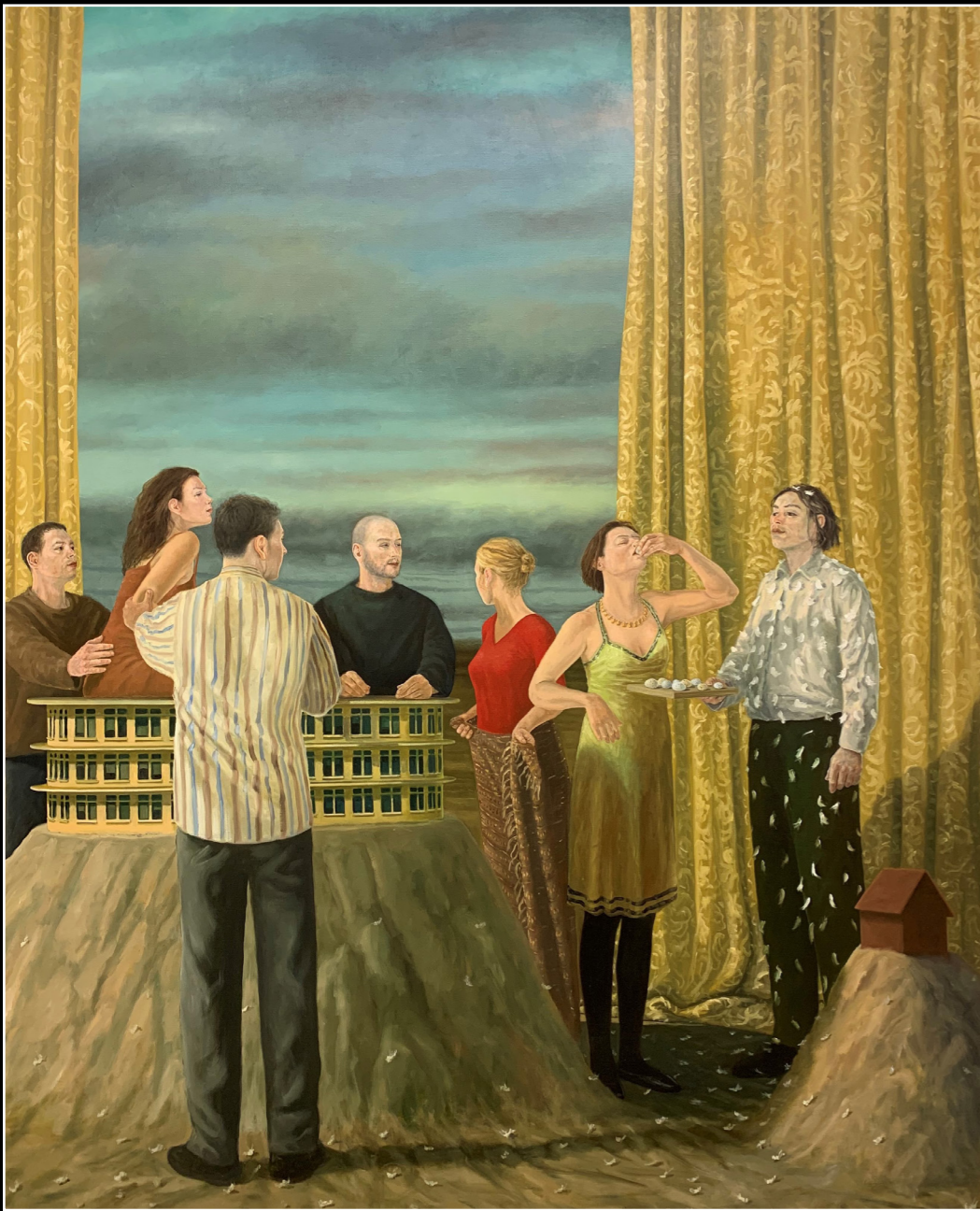
Above The architect 2008 oil on canvas 244 x 197 cm