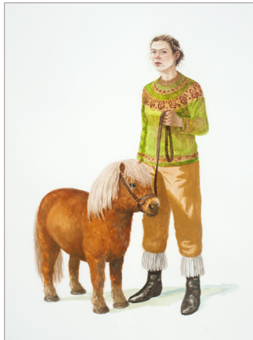
Left In winter it gets under her skin 2015 watercolour and gouache on paper 76 x 57 cm

Artworks courtesy of Graeme Drendel Graeme Drendel appears courtesy of Australian Galleries Sydney and Melbourne