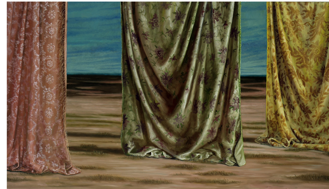
Above The decorators 2008 oil on linen 122 x 210 cm