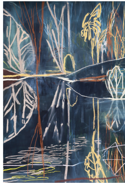
Left Bellbird sounds I 2019 watercolour, gouache and pastel on paper 155 x 105 cm