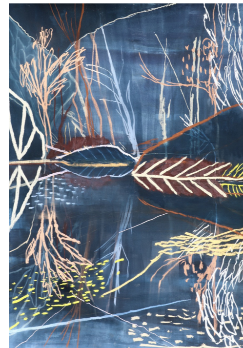
Right Bellbird sounds II 2019 watercolour, gouache and pastel on paper 155 x 105 cm