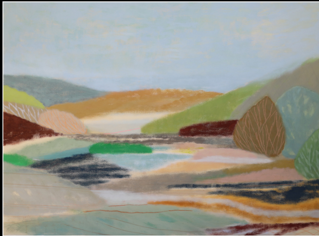
Above Follow you 2018 acrylic and pastel on canvas 112 x 152 cm