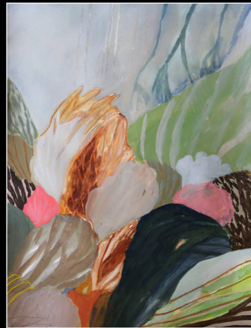
Right Staghorn 2017 gouache, watercolour and pastel on arches paper 78 x 58 cm