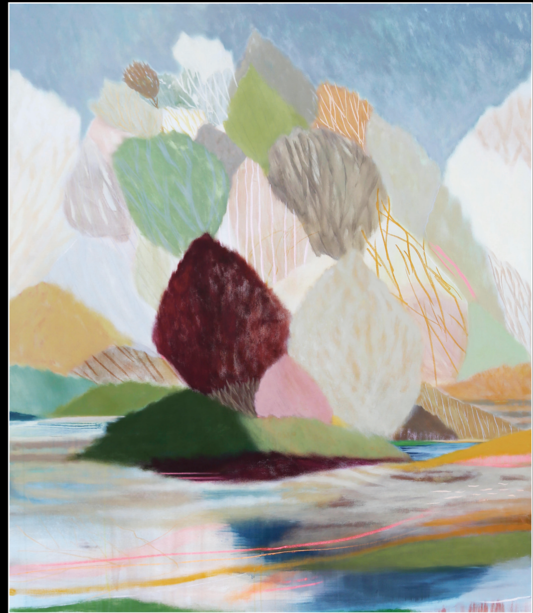
Cover Eternity, the sky that holds us 2017 acrylic and pastel on canvas 214.0 x 183 cm