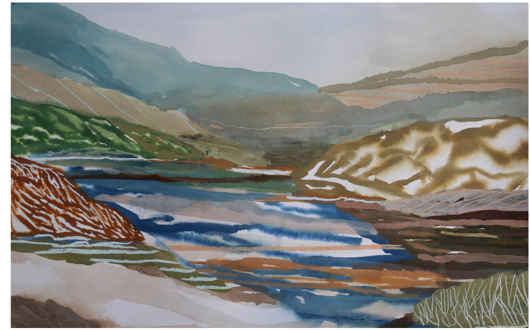
Above The way you are 2017 gouache, acrylic and pastel on paper 58 x 78 cm (detail)