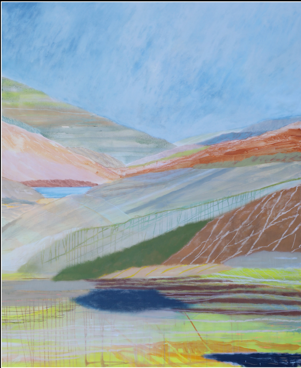
Above Always to the end 2018 acrylic and pastel on canvas 182 x 152 cm