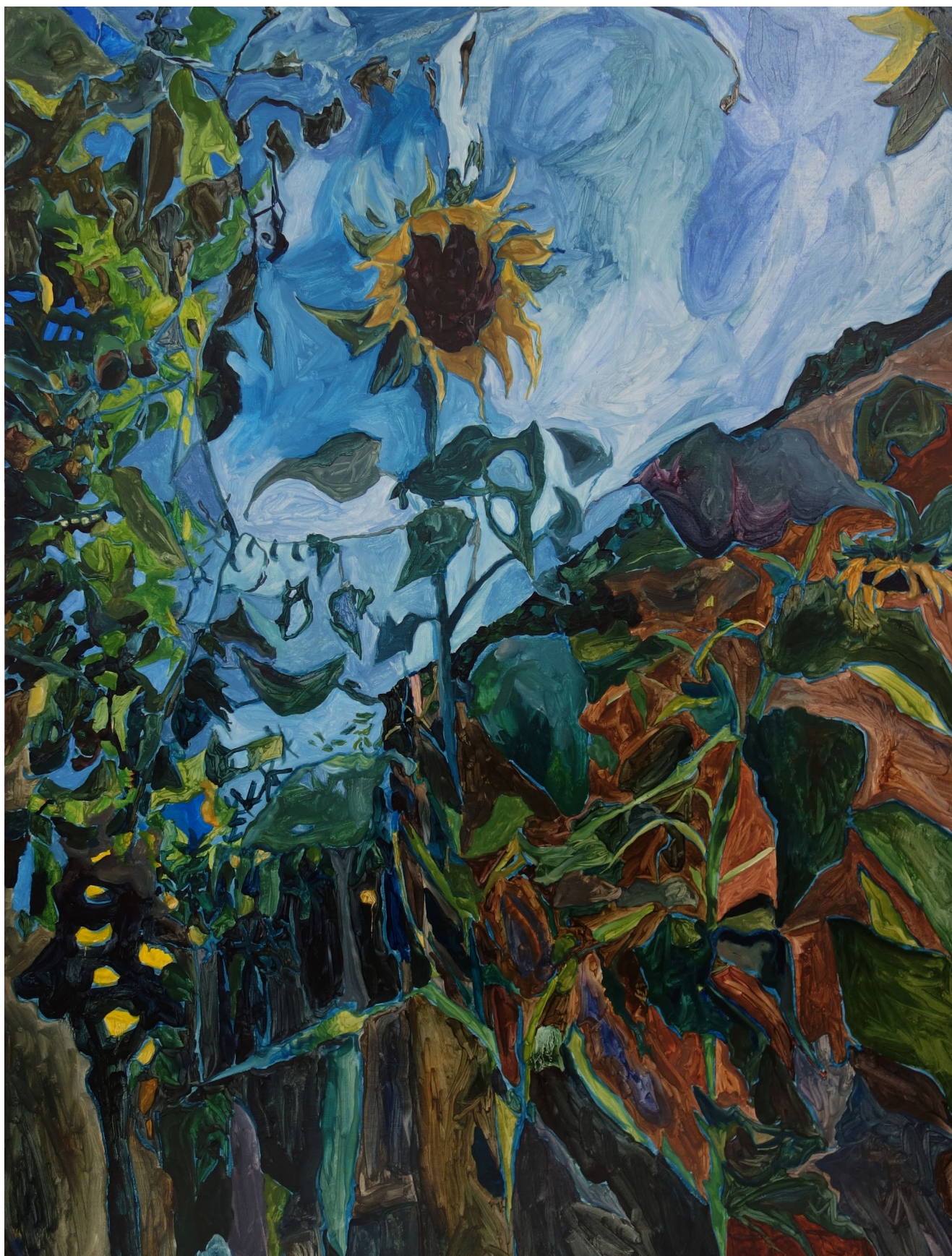
Season's watcher 2022 Oil on board 122 cm x 90 cm (Framed) $3,000