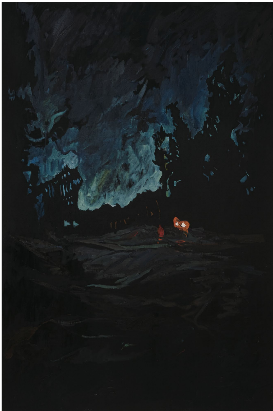
Horizon's tooth 2019 Oil on canvas 152.6 cm x 101.8 cm $3,100