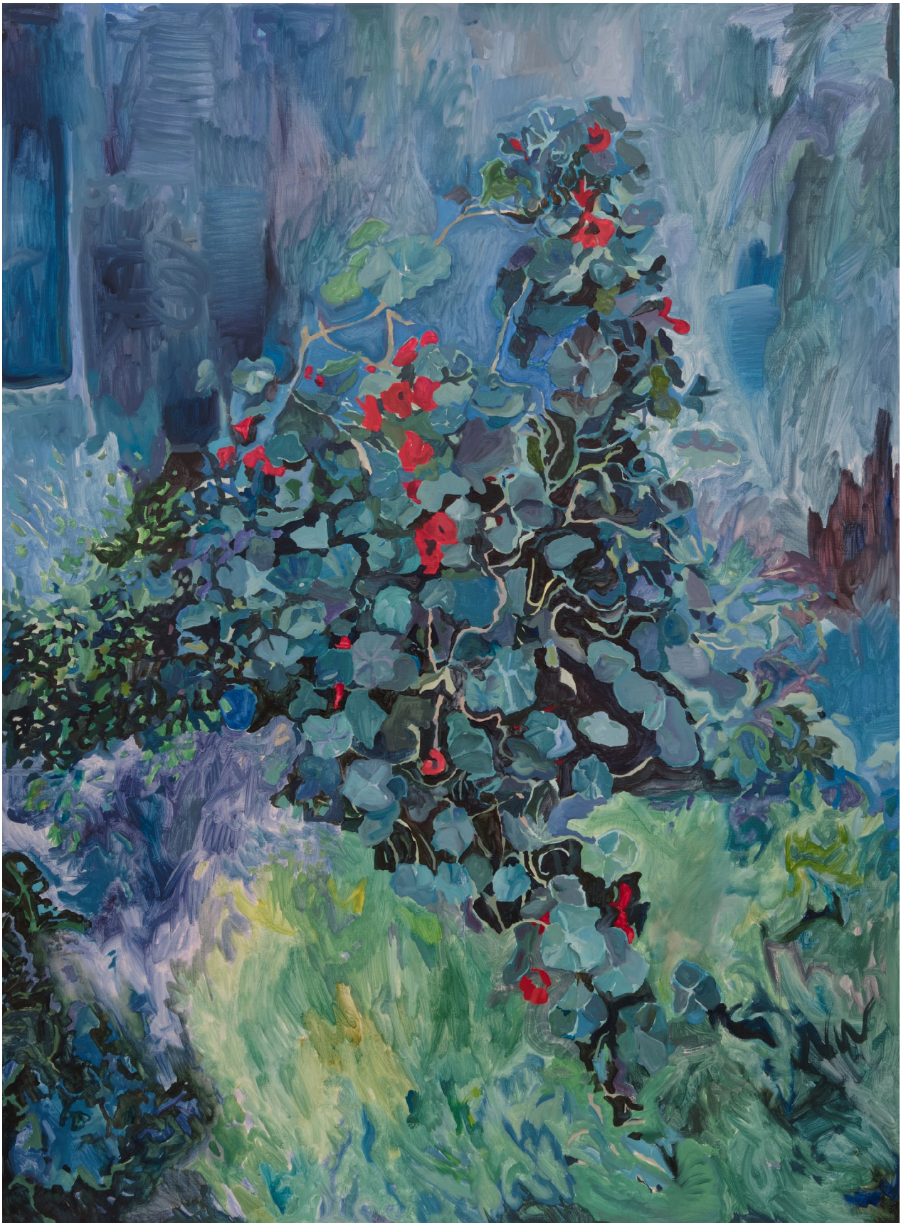
The grace of the world 2022 Oil on board 122 cm x 90 cm (Framed) $3,000