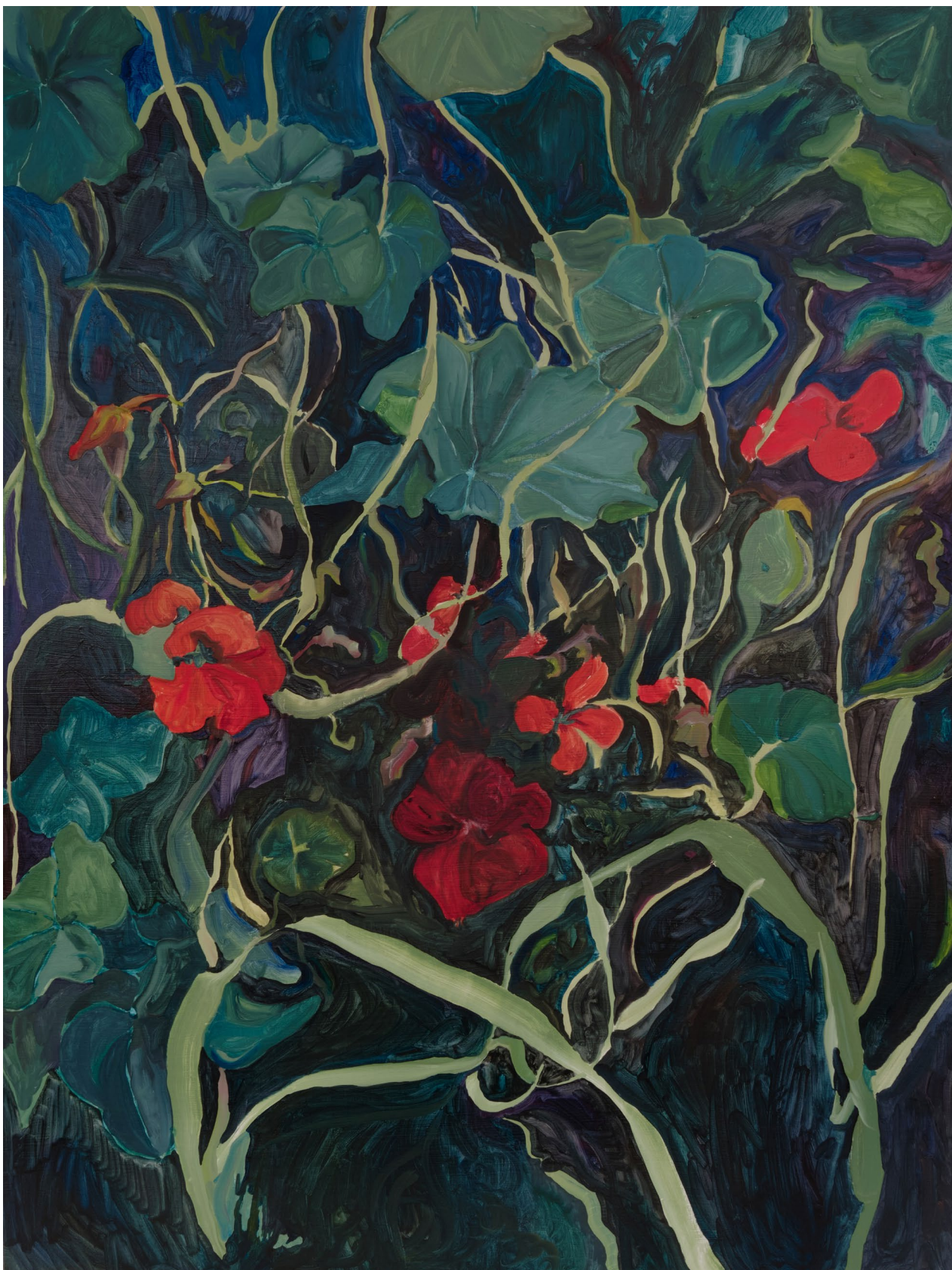
Bright Pocket 2022 Oil on board 81.5 cm x 61 cm (Framed) $1,600