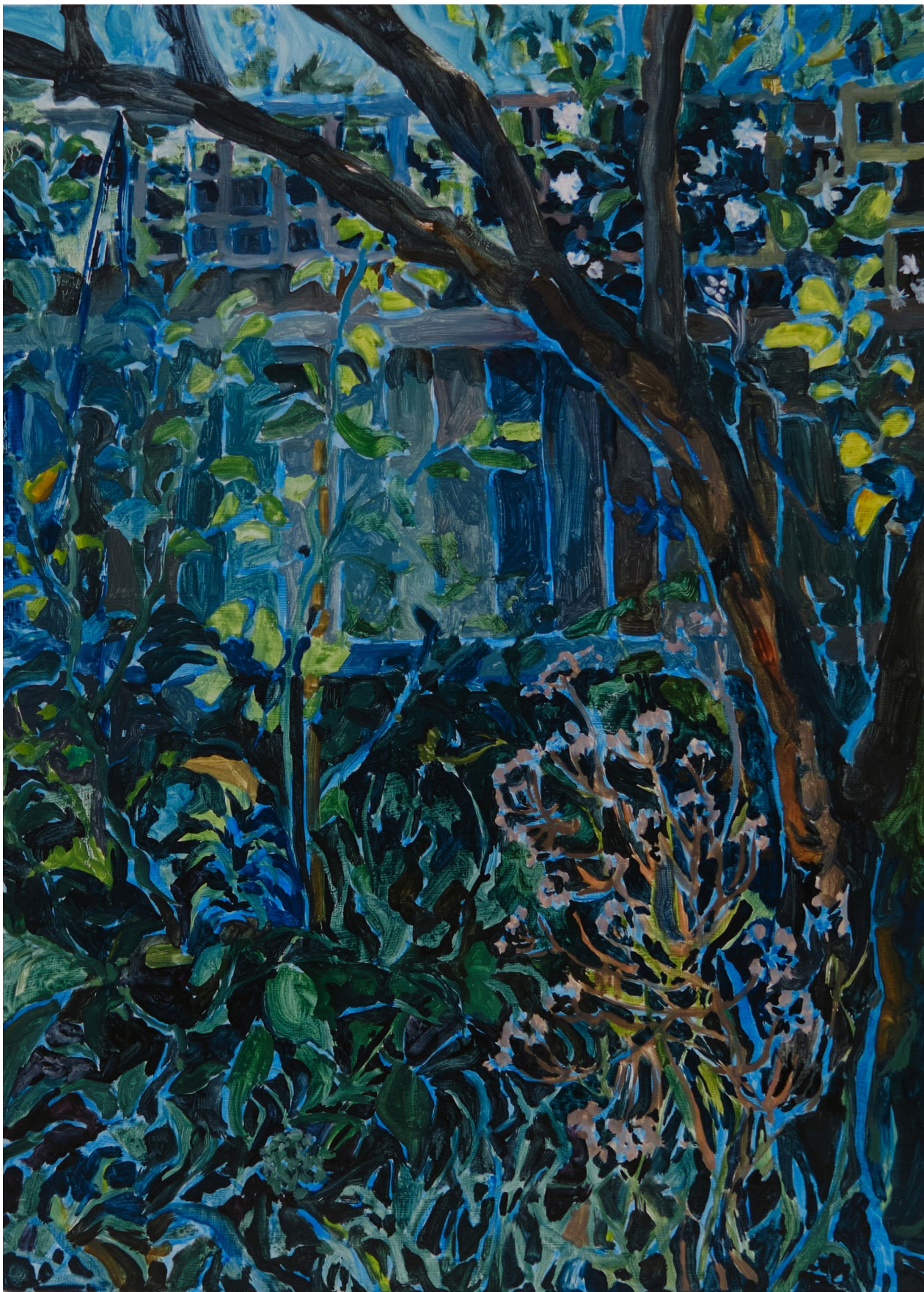
Wet morning 2022 Oil on board 47.5 cm x 34 cm (Framed) $950