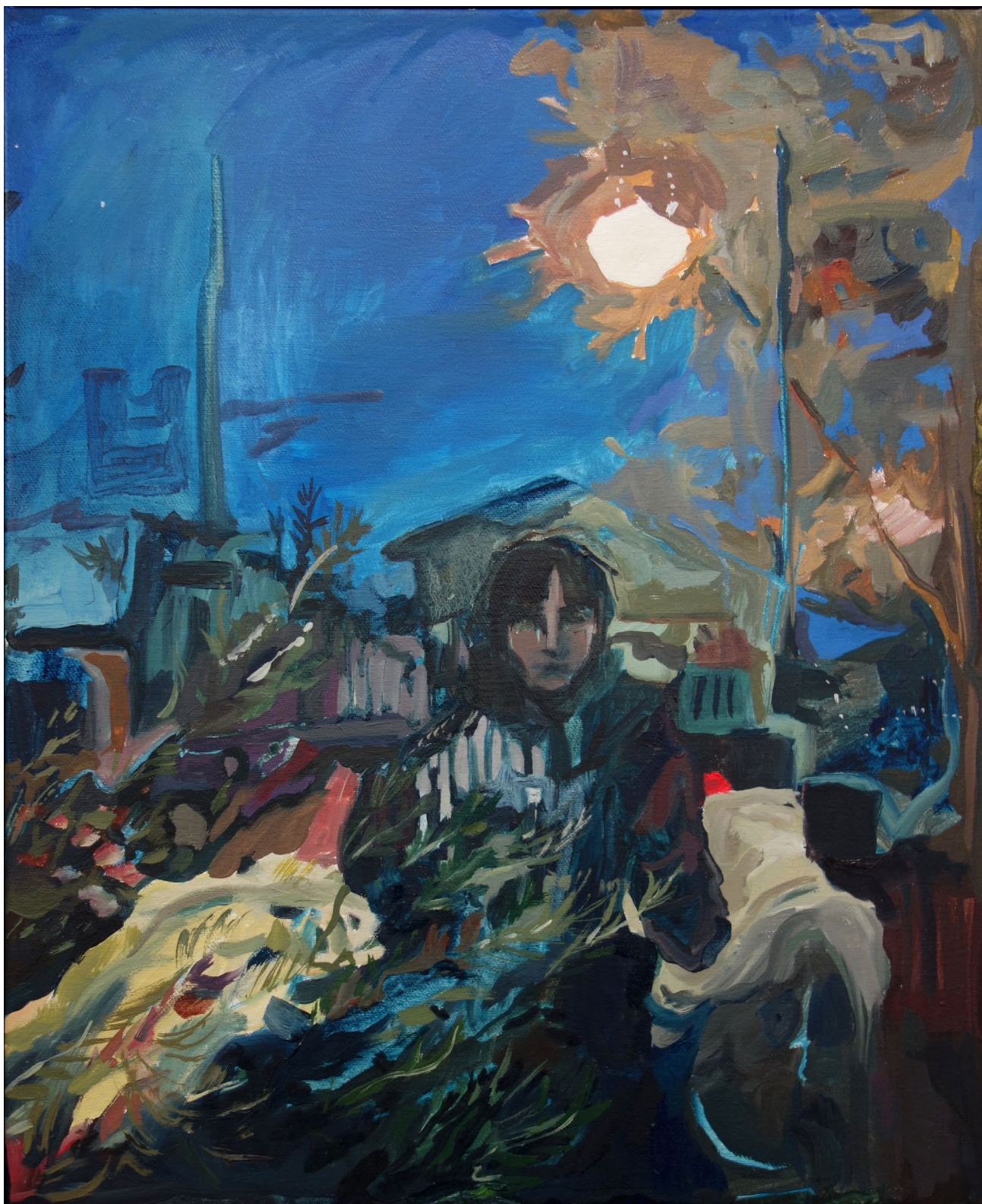
In between glass 2020 Oil on canvas 56 cm x 46 cm (Framed) $1,200