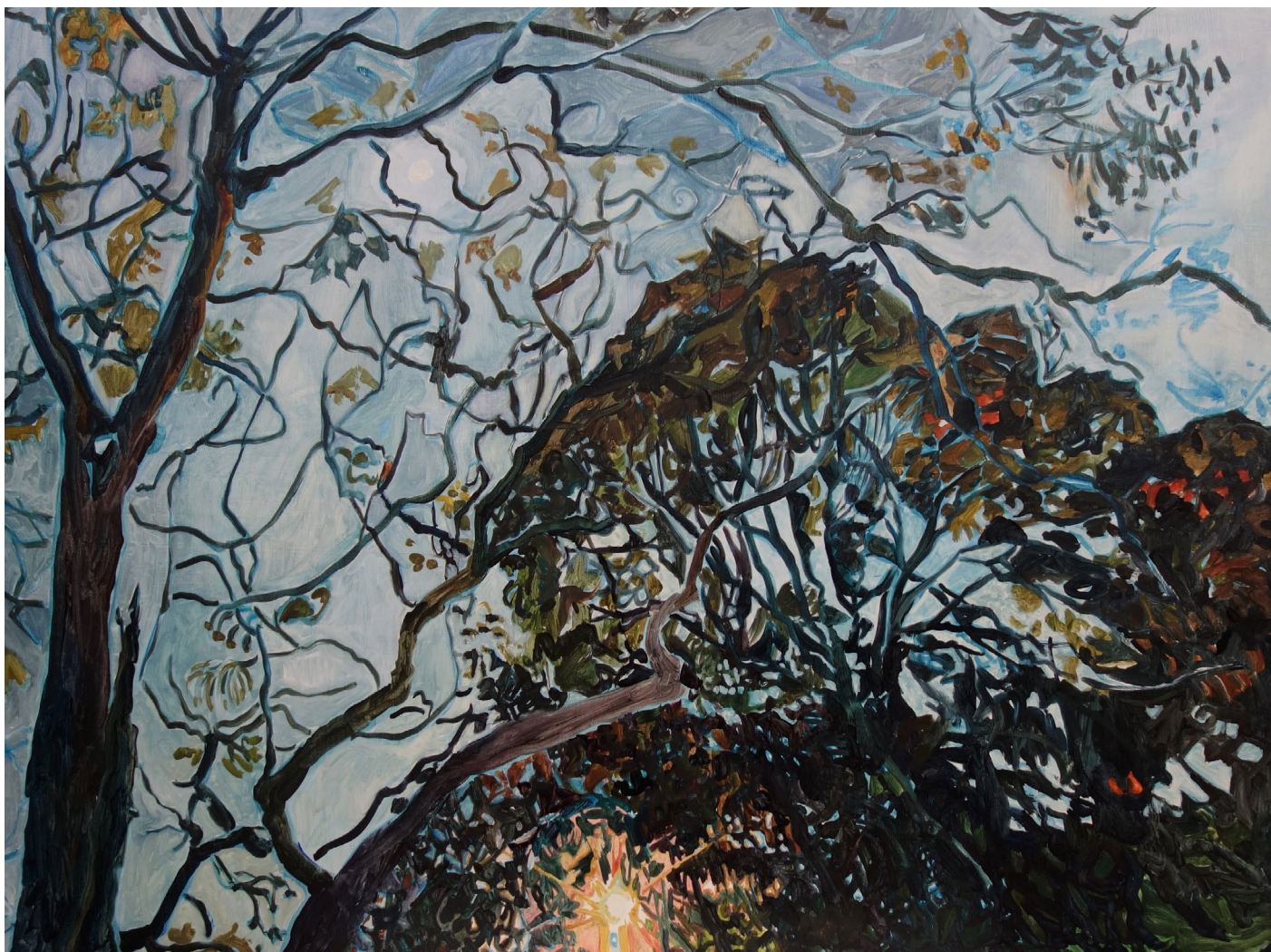
Winds up and over 2022 Oil on board 60.6 cm x 81 cm (Framed) $1,600