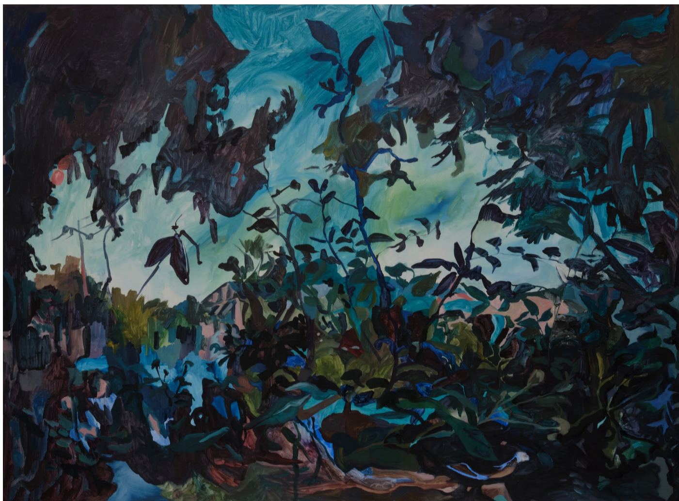
Holding place 2021 Oil on board 90 cm x 122 cm (Framed) $3,000