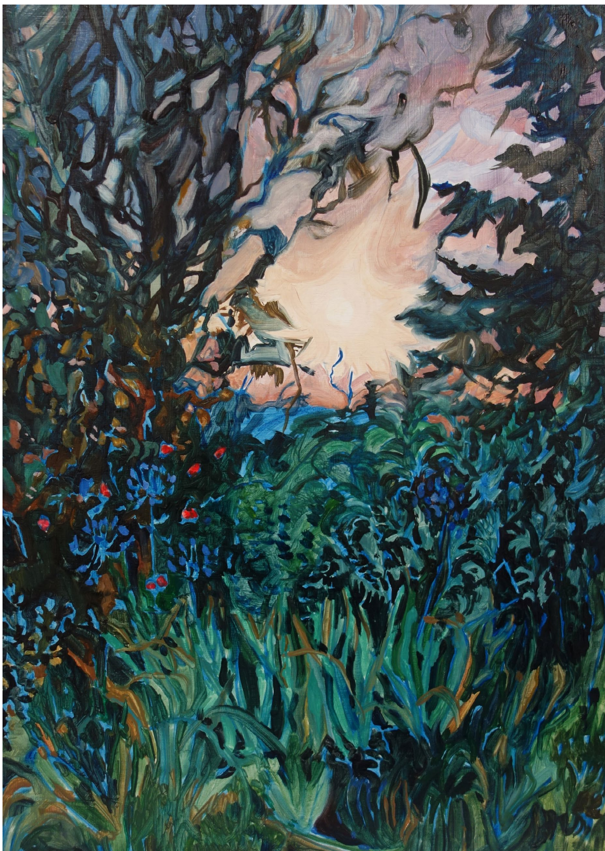
Evening walk, pink dreams 2022 Oil on board 47.5 cm x 34 cm (Framed) $950