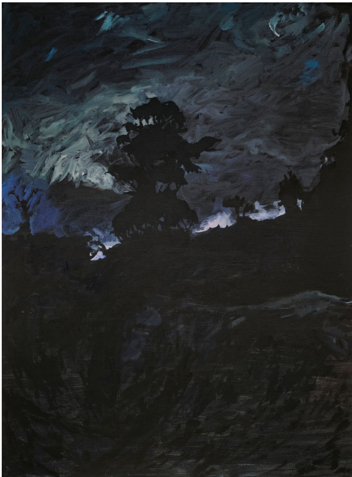
Morning poem 2020 Oil on canvas 122.5 cm x 91.7 cm $2,700