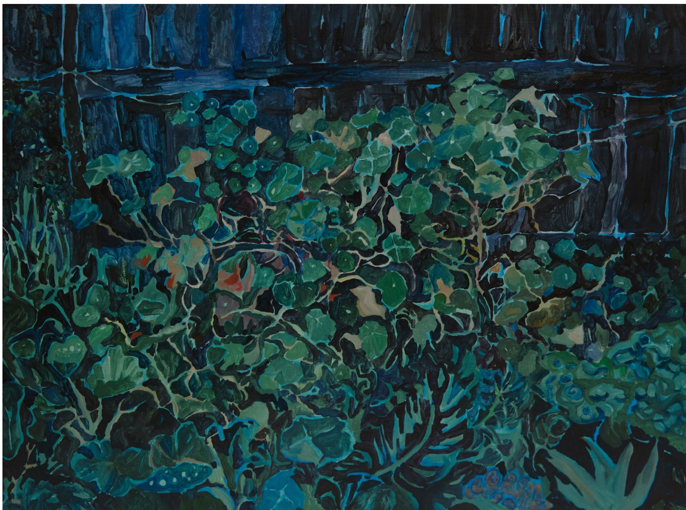
Under the moon 2022 Oil on board 60.8 cm x 81.2 cm (Framed) $1,600