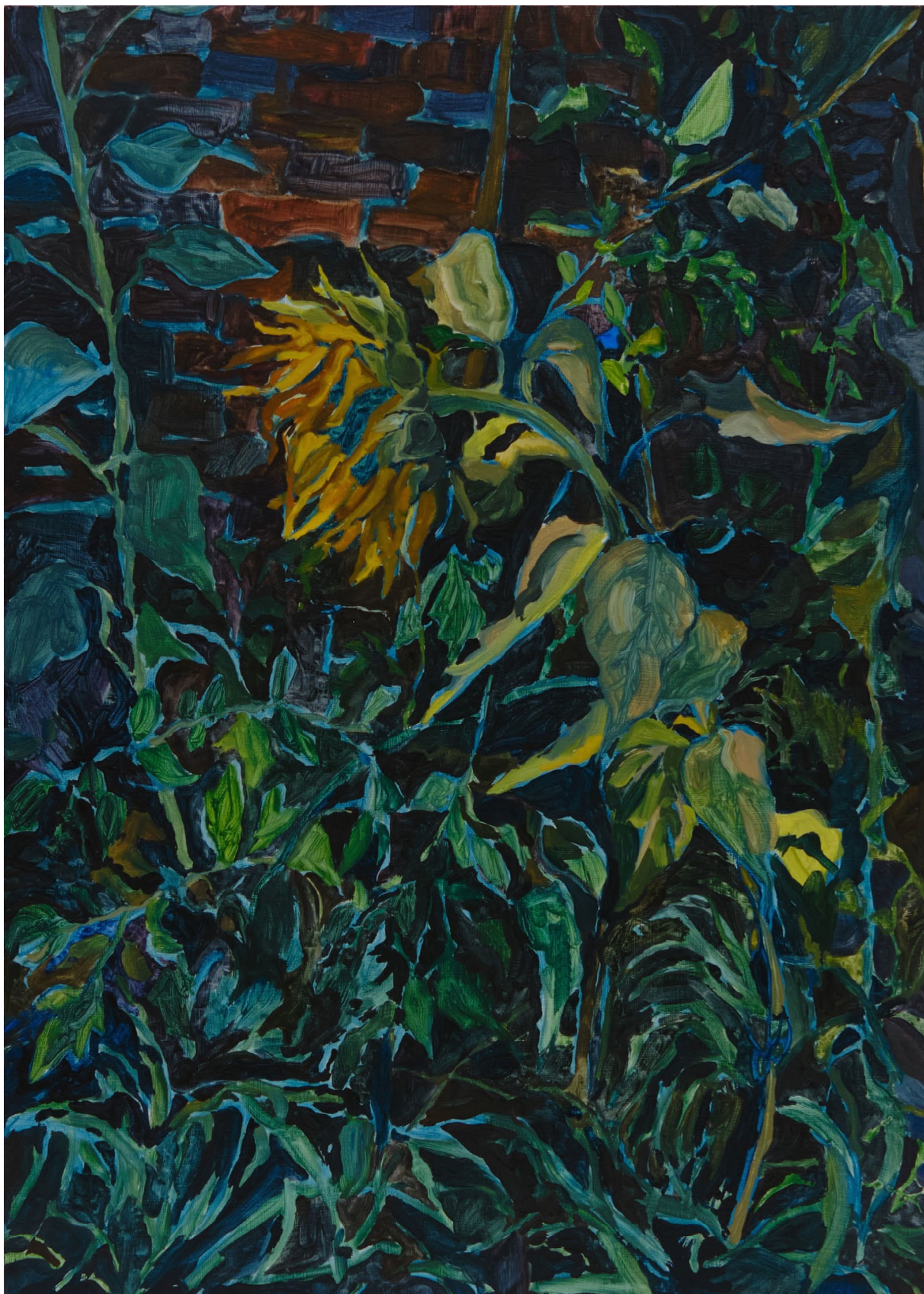
It would be enough 2022 Oil on board 47.5 cm x 34 cm (Framed) $950