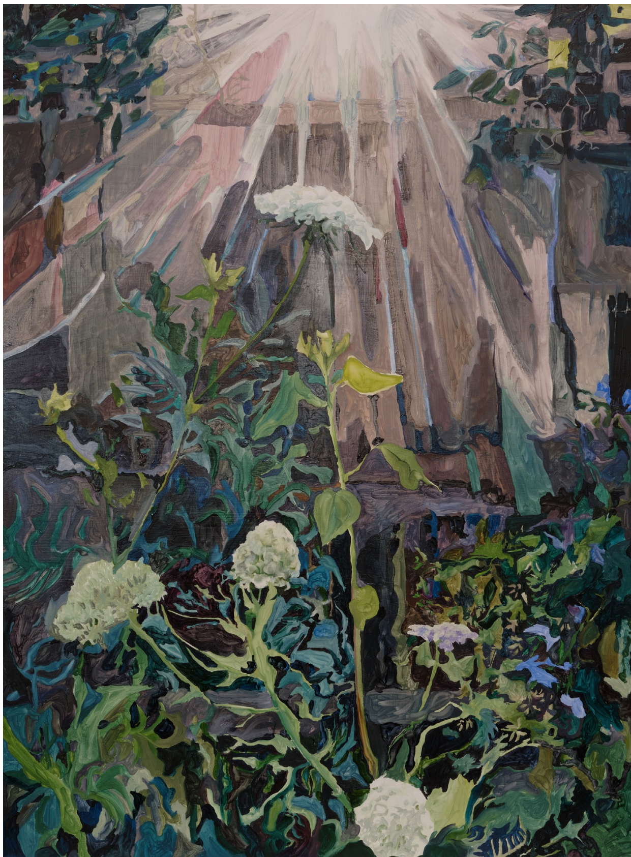
How much honey can the heart stand 2022 Oil on board 122 cm x 90 cm (Framed) $3,000