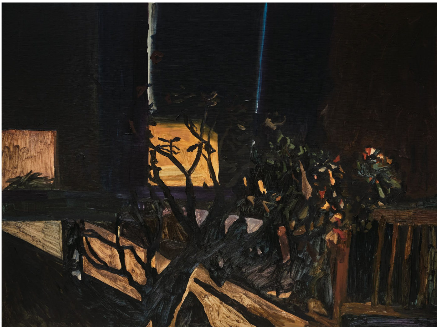
If a restiveness, like light and cloud shadow