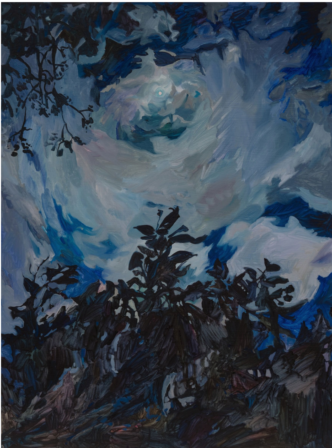
Moonward my soul 2021 Oil on board 81.5 cm x 61 cm (Framed) $1,600