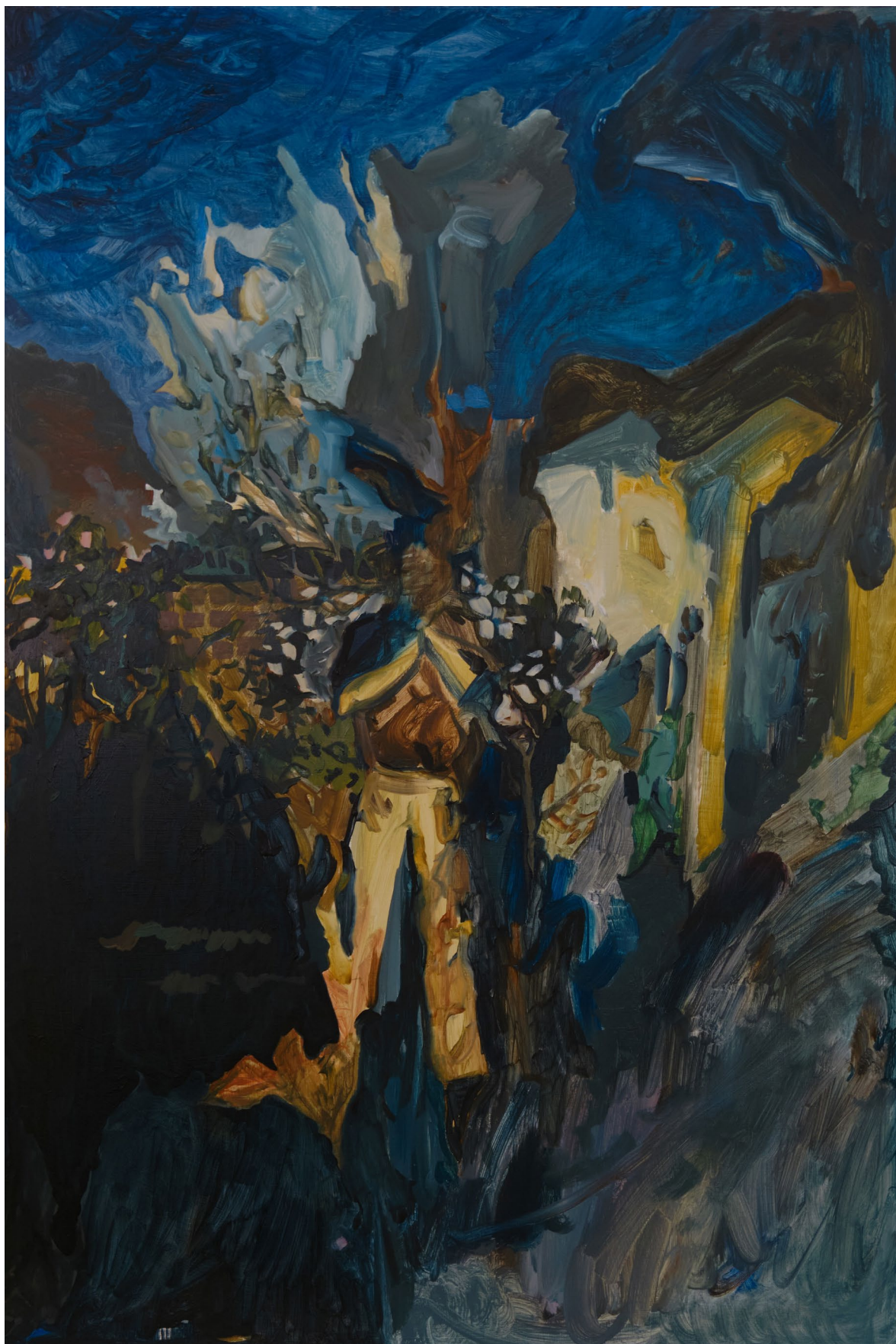
Night's promise 2022 Oil on board 91.8 cm x 61.2 cm (Framed) $1,700