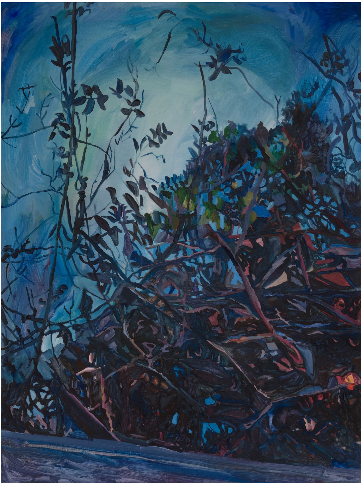
Near that porous line 2021 Oil on board 81.5 cm x 61 cm (Framed) $1,600