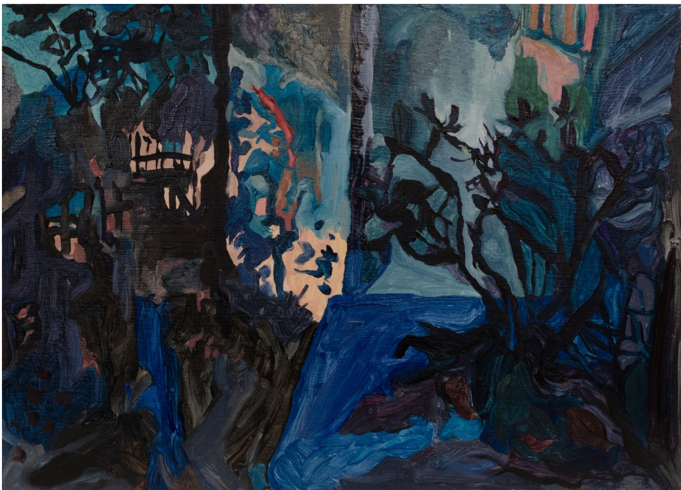
Attending 2022 Oil on board 34 cm x 47.5 cm (Framed) $950