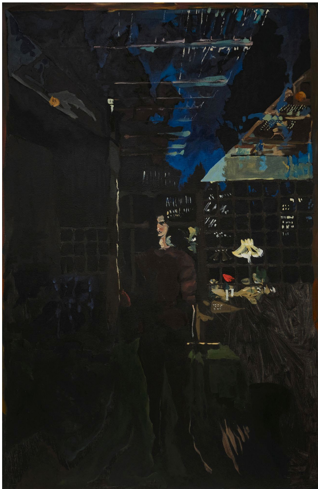
But love is the sky 2020 Oil on canvas 152.6 cm x 101.8 cm $3,100