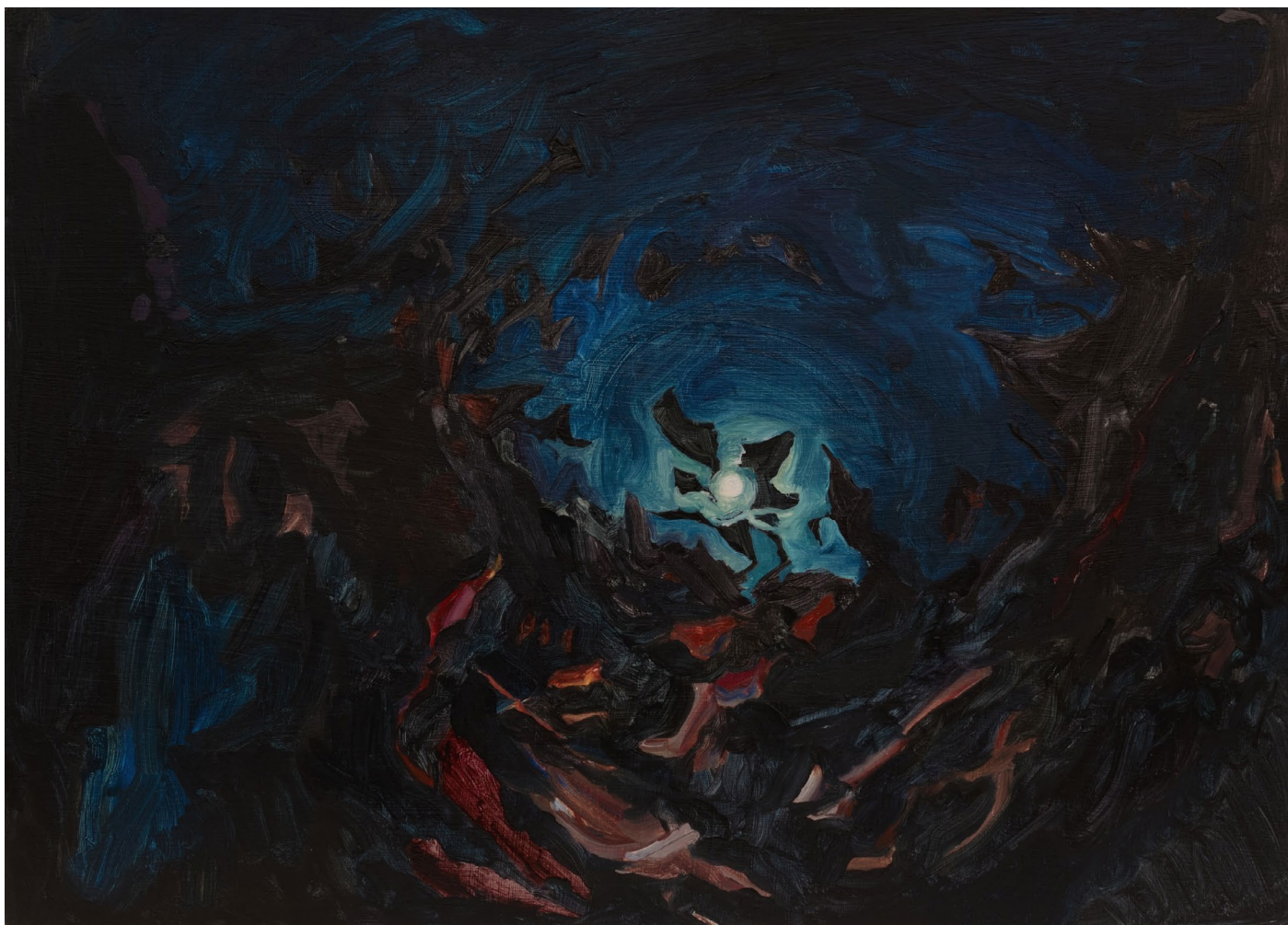
The endless 2022 Oil on board 34 cm x 47.5 cm (Framed) $950