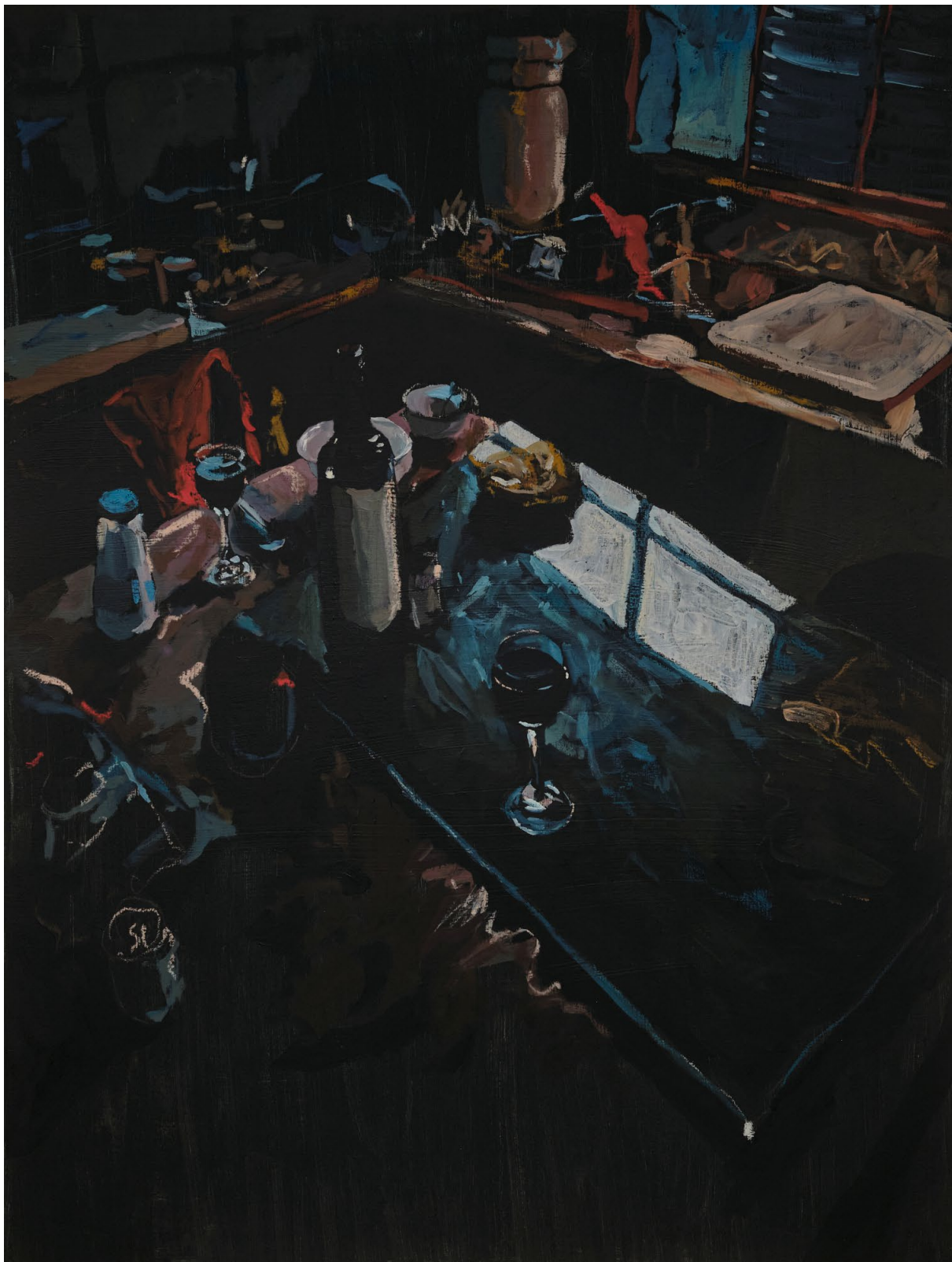
We overwinter 2020 Oil and oil stick on canvas 121.9 cm x 91.4 cm $2,700