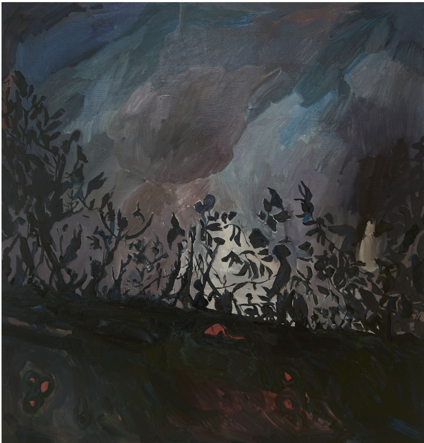
Breathing in space 2021 Oil on board 63 cm x 61 cm (Framed) $1,450