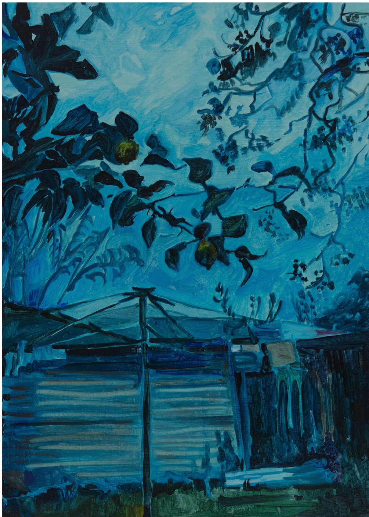
Blue and lemons 2022 Oil on board 47.5 cm x 34 cm (Framed) $950