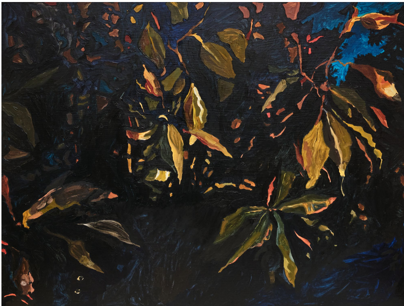
Where it is 2020 Oil on board 45 cm x 60 cm (Framed) $1,250