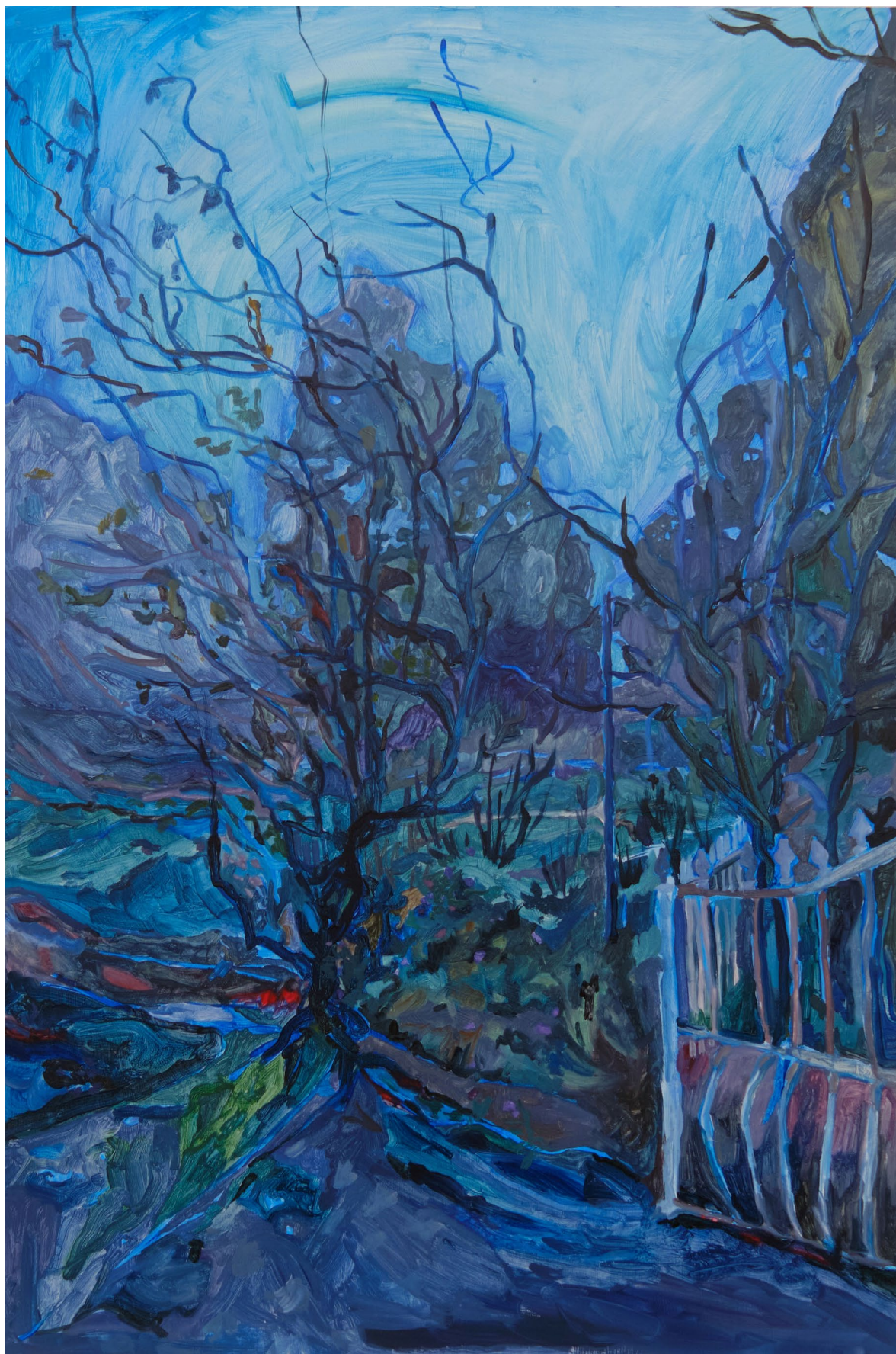
Early winter 2022 Oil on board 90.3 cm x 60 cm (Framed) $1,700