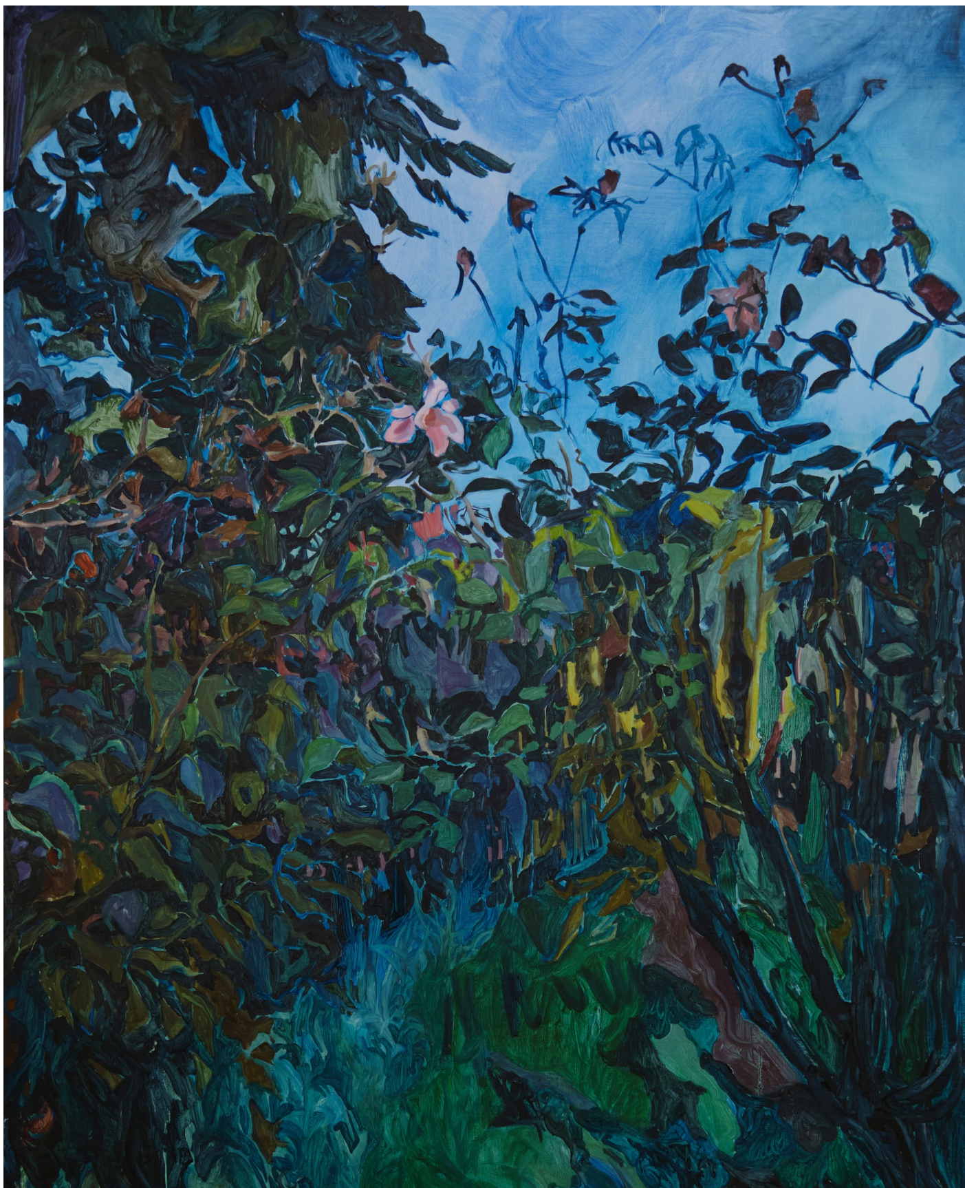
Roses 2022 Oil on board 122 cm x 90 cm (Framed) $3,000