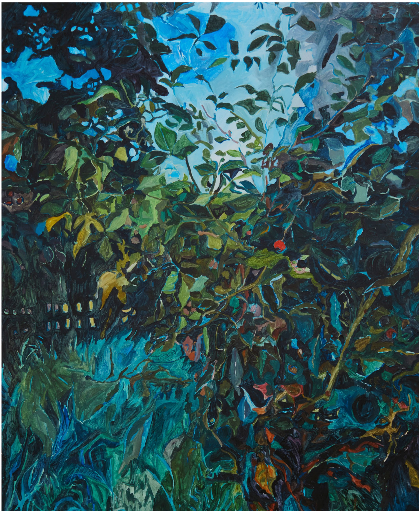
A harvest of green 2022 Oil on board 122 cm x 90 cm (Framed) $3,000