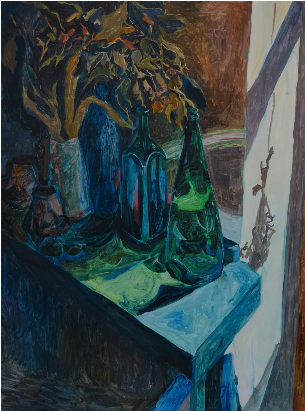
Light slipping 2022 Oil on board 81.2 cm x 60.6 cm (Framed) $1,600