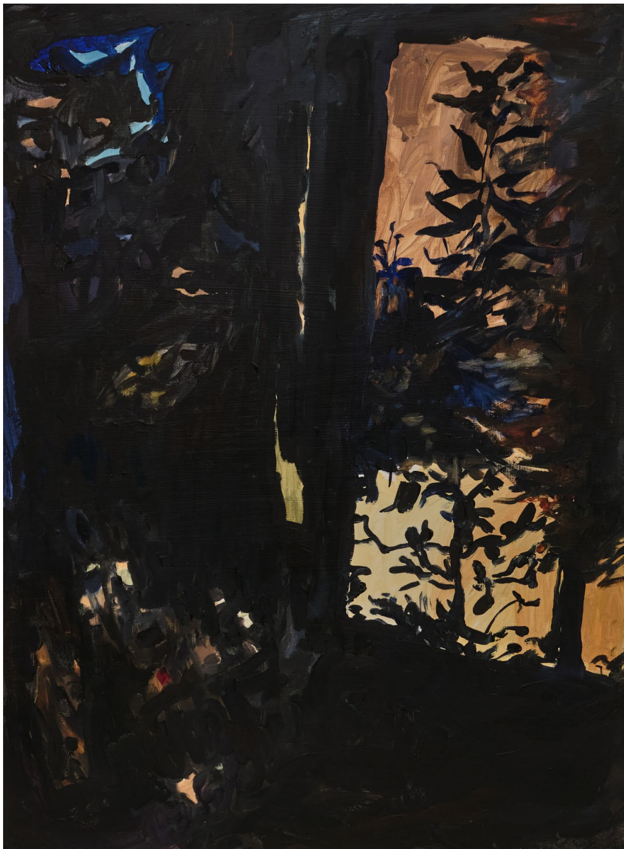
Shadows on the wall 2020 Oil on board 60.8 cm x 45 cm (Framed) $1,250