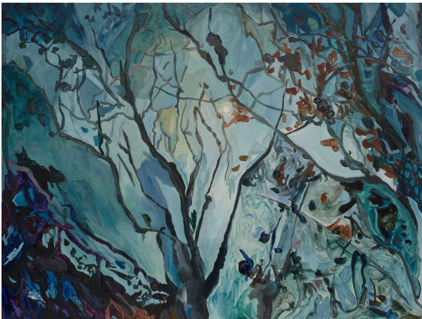
Moon's favour 2022 Oil on board 61 cm x 81.5 cm (Framed) $1,600