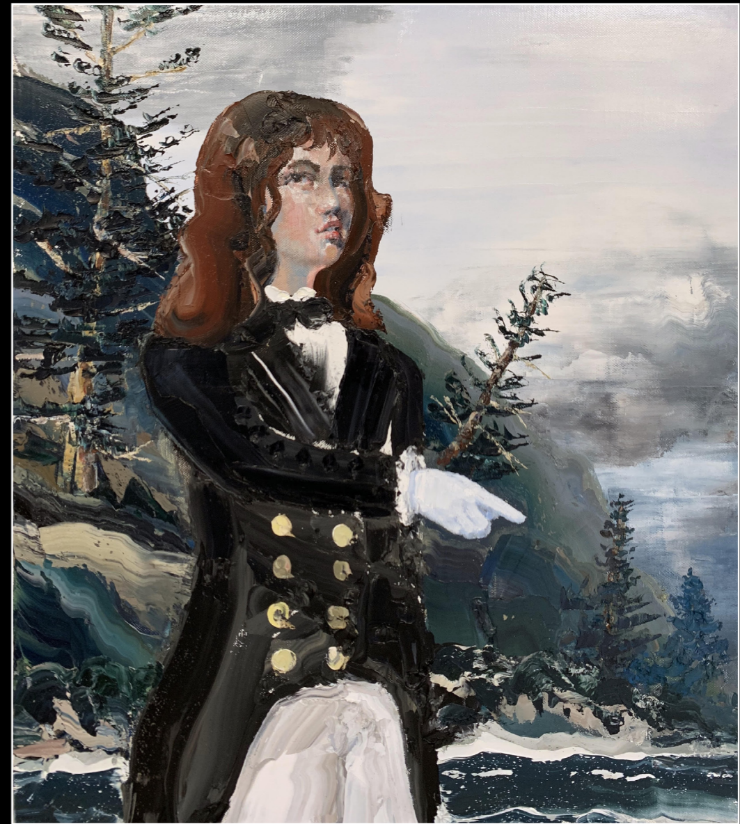
Cover Young Joseph Banks 2020 oil on linen 138 x 122 cm