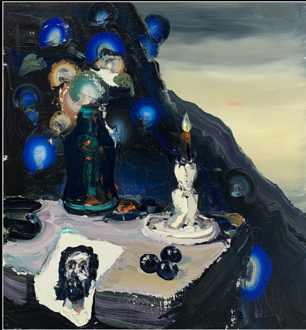
Above Cold April Night 2020 oil on linen 122 x 122 cm