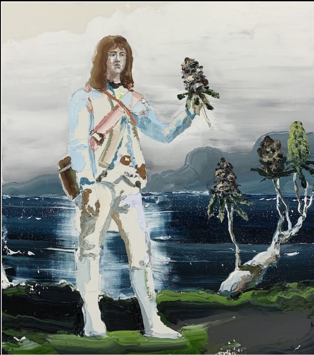
Above Joseph Banks Discovering the Banksia 2020 oil on linen 138 x 122 cm