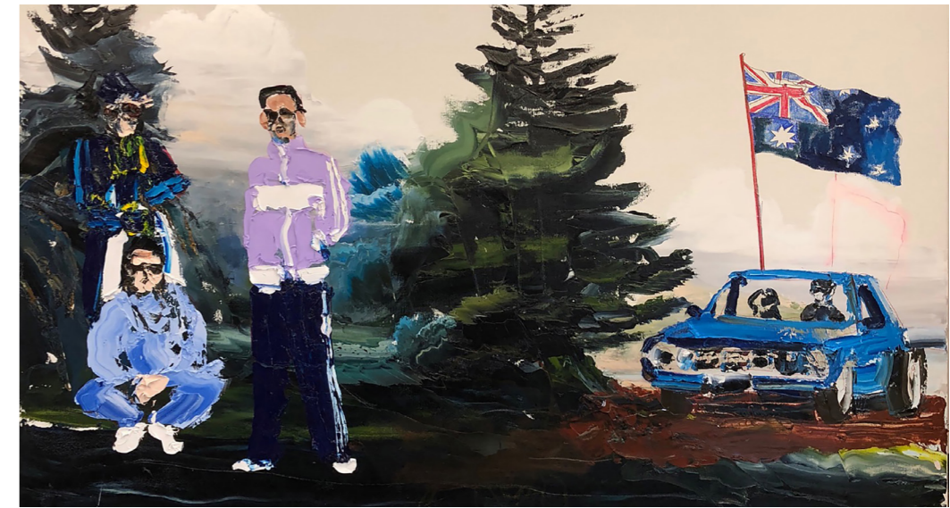
Above Yeah The Boys 2018 oil on linen 200 x 300 cm