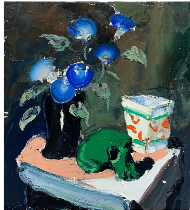
Left Morning Glory Afternoon Disgrace 2020 oil on linen 91 x 81 cm