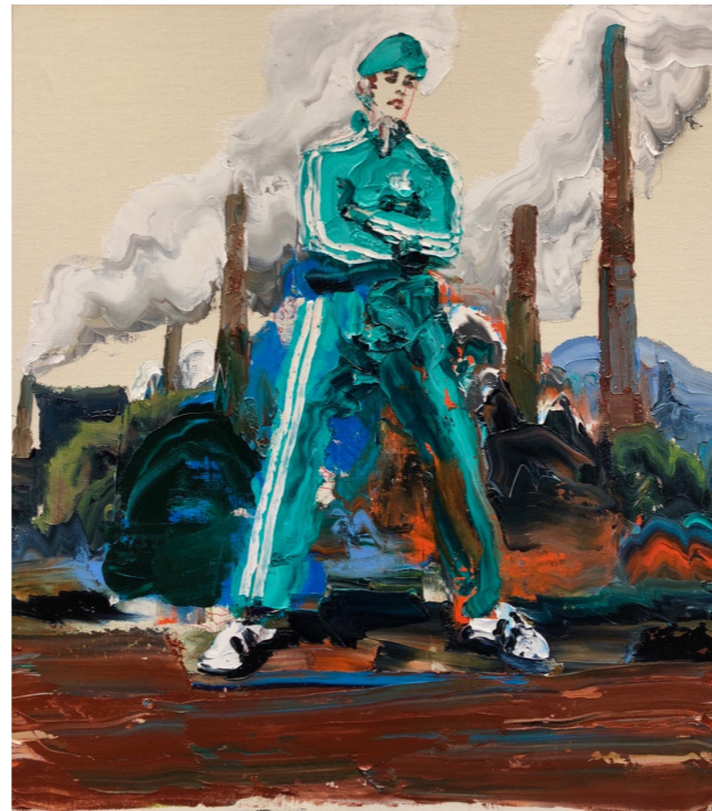
Right Body Movin 2018 oil on linen 138 x 122 cm