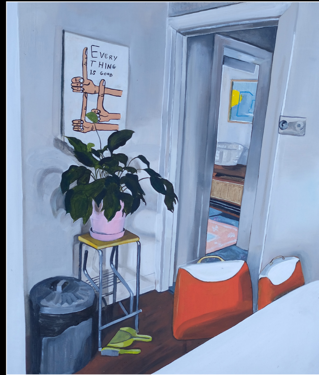
Cover Everything is Good 2020 oil on panel 72 x 60 cm