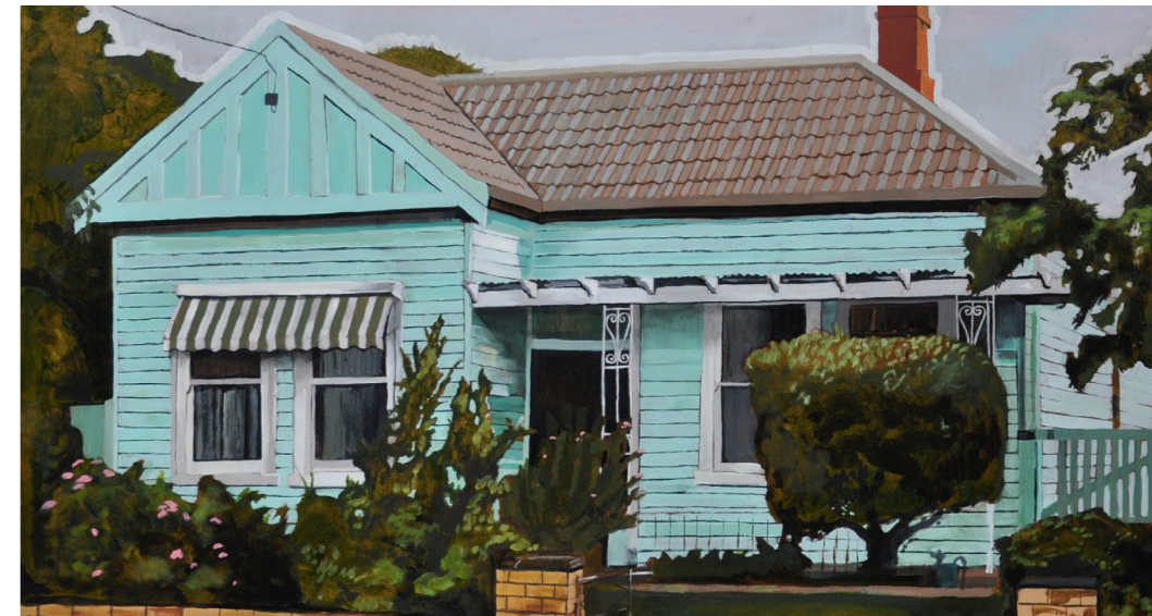
Above Little Decisions 2020 oil on panel 90 x 100 cm (detail)