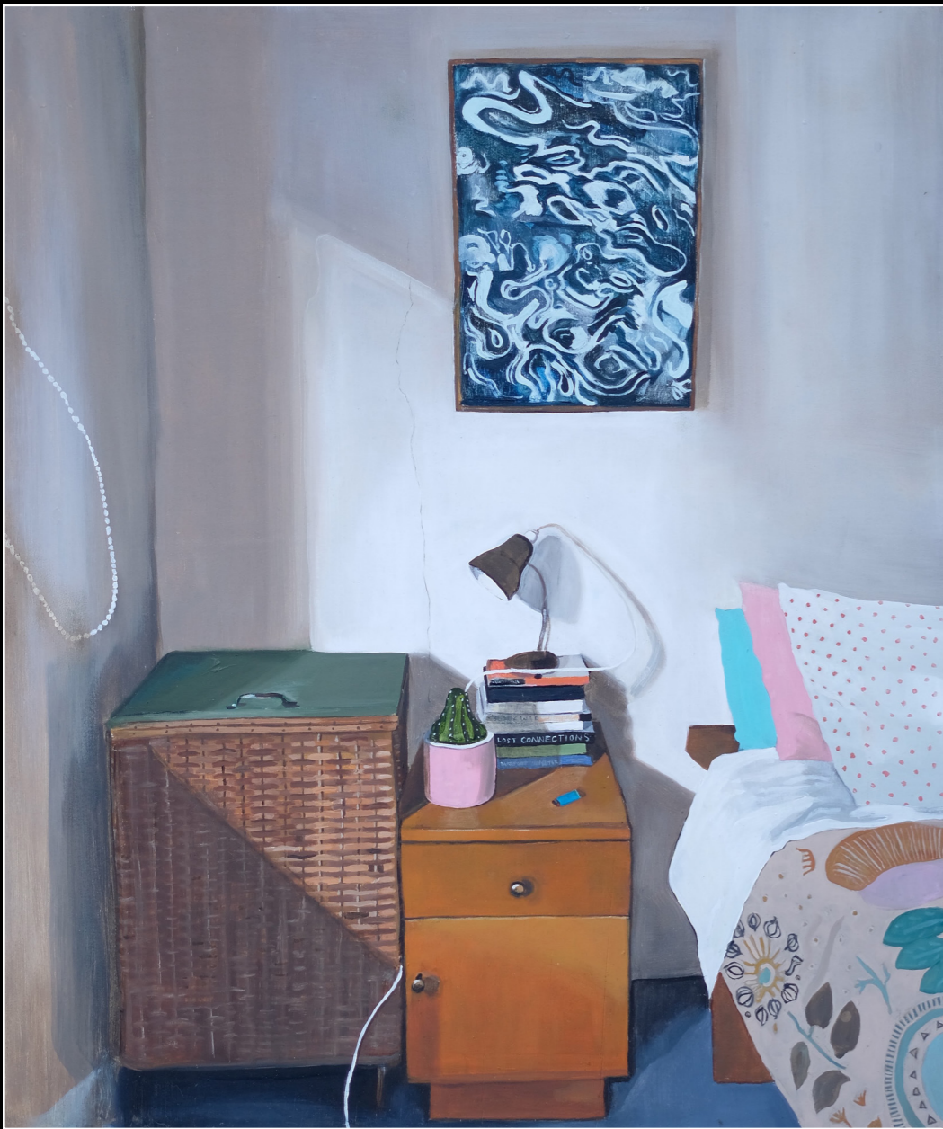
Above Hanging Above Your Side 2020 oil on panel 72 x 60 cm