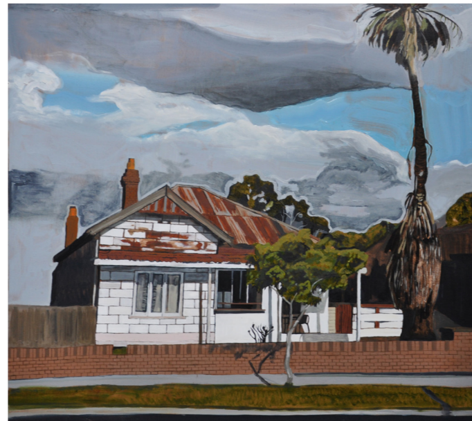
Above Shoes off or on 2020 oil on panel 90 x 100 cm