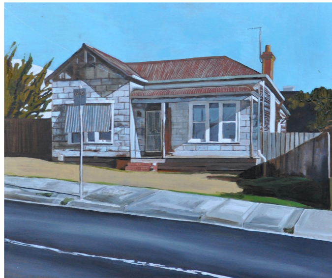
Above Somewhere Along Albion St 2019 oil on panel 60 x 72 cm