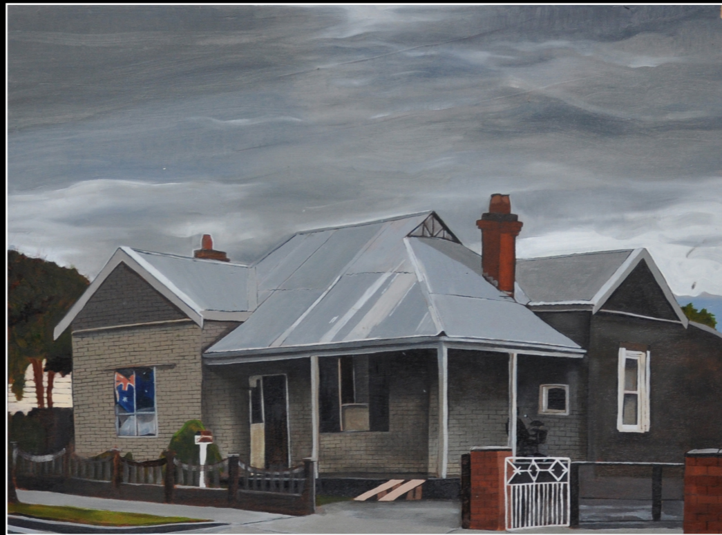
Above Best to Stay Outside 2020 oil on panel 72 x 60 cm