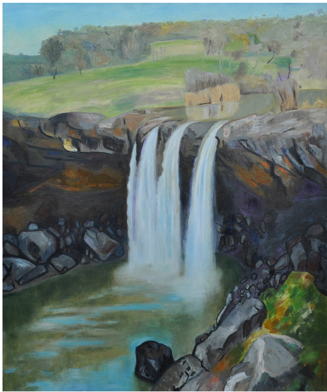
Above The Wannon Falls 2000 oil on canvas 183 x 135 cm