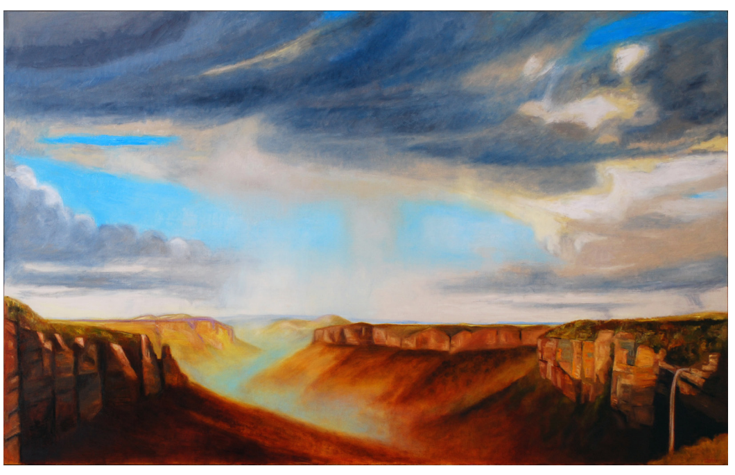
Above Govetts Leap 2010 oil on linen 152 x 244 cm