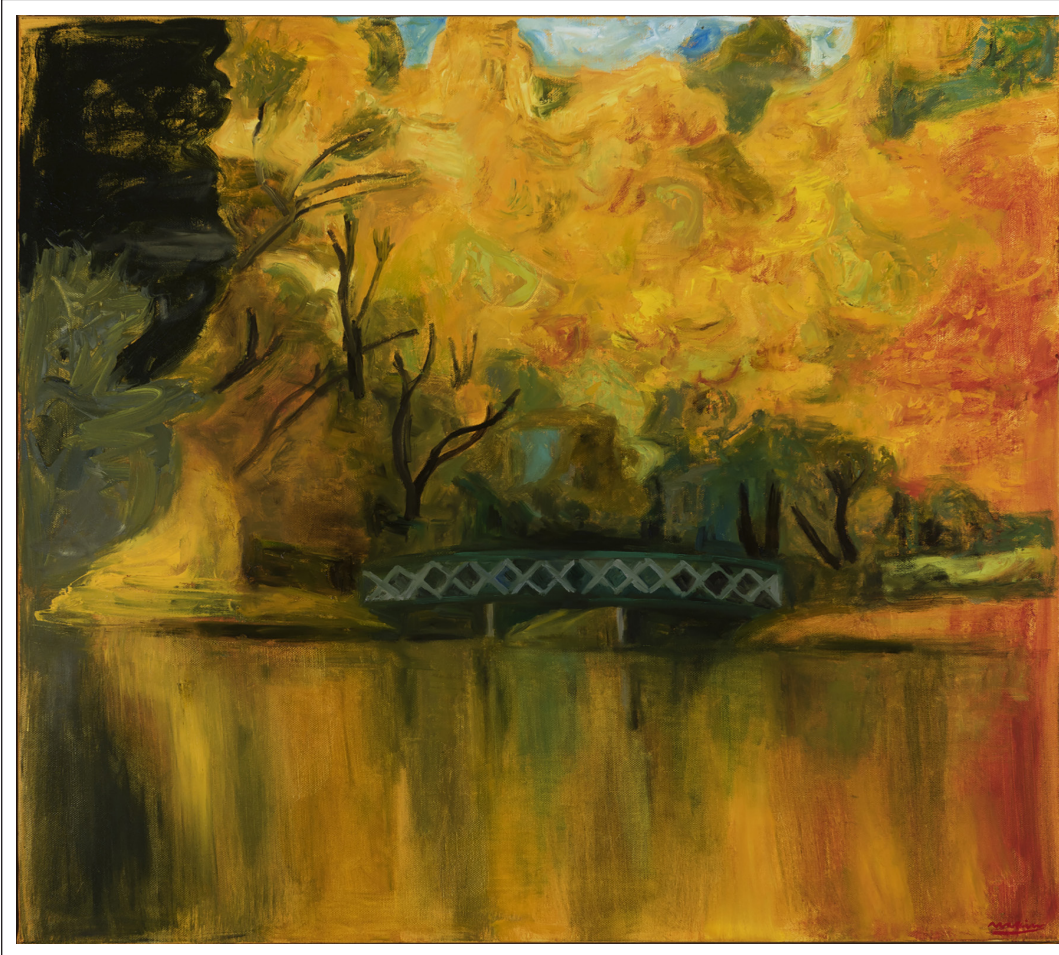
Above Lake Daylesford Footbridge - Autumn 2018 oil on linen 92 x 92 cm