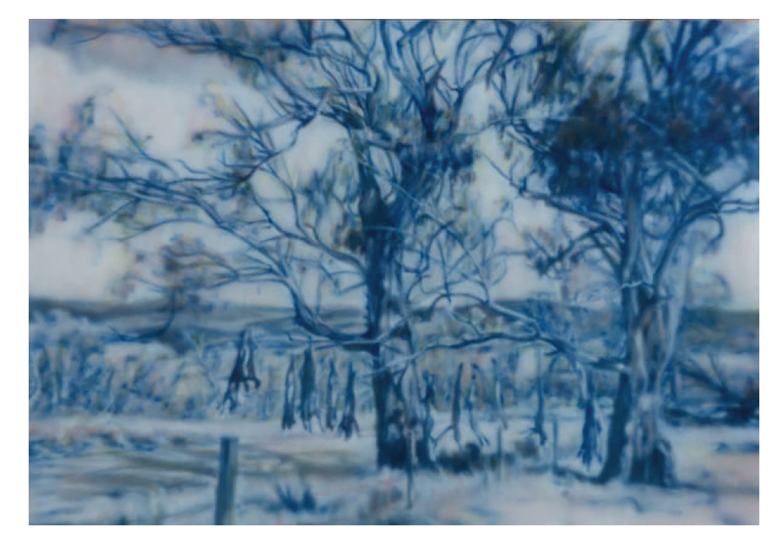
Right Beneath this dry land 2016 Acrylic on canvas 198 x 137 cm