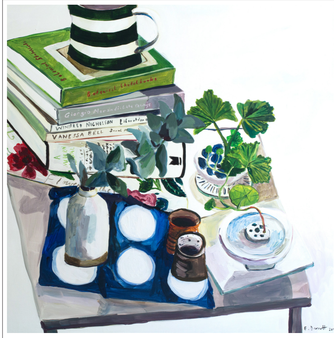
Above The Beginning of Spring 2017 oil on linen 92 x 82 cm