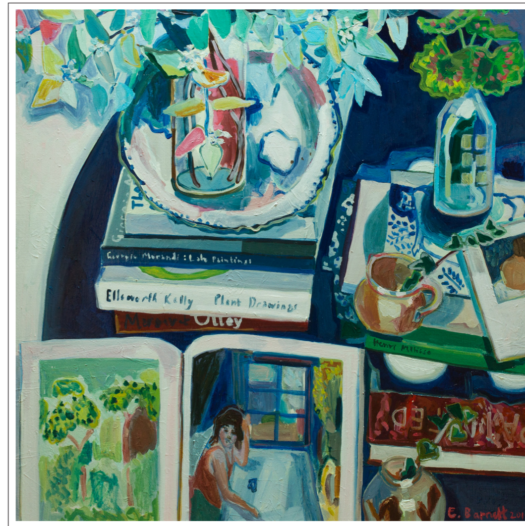
Above Window Reflections 2019 oil on linen 71 x 71 cm