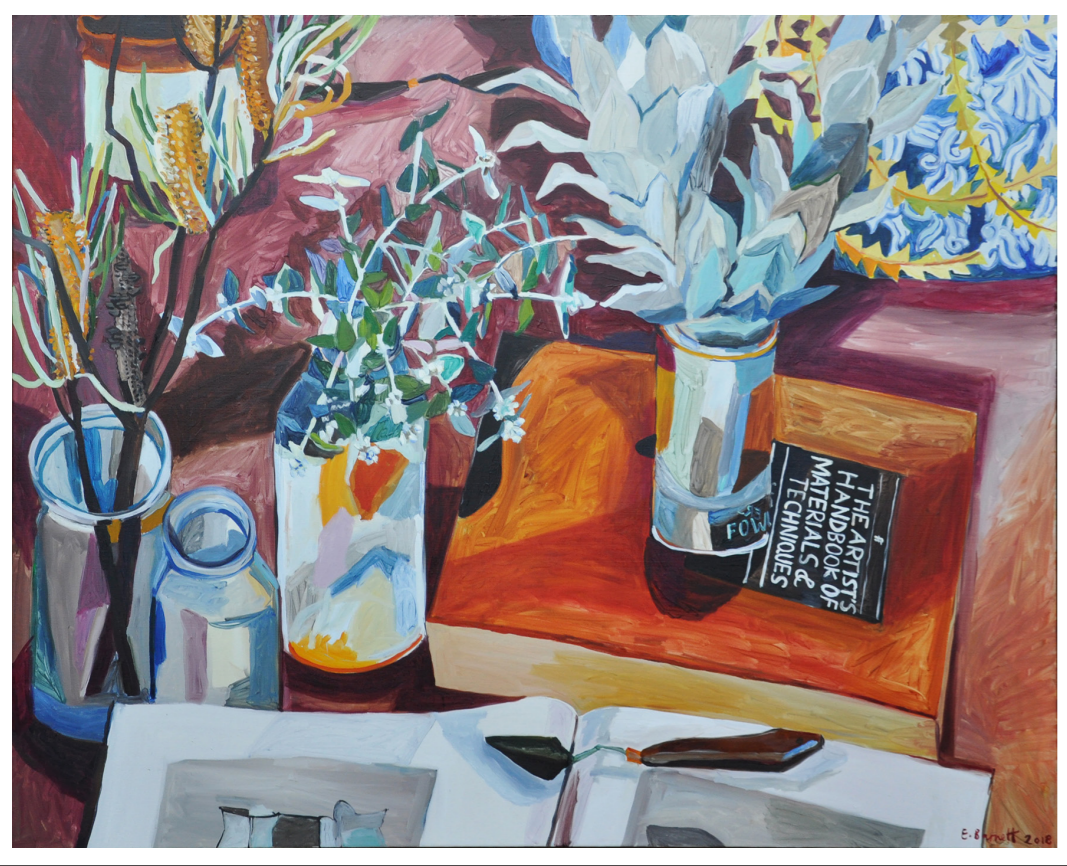
Above The Artist's handbook of materials and techniques 2019 oil on linen 123 x 152 cm