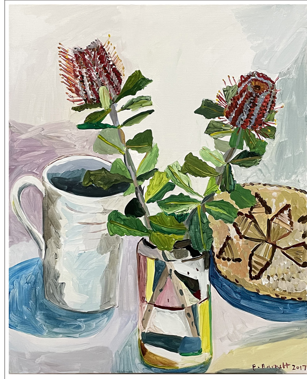
Above Two Banksias and a White Jug 2017 oil on linen 72 x 67 cm