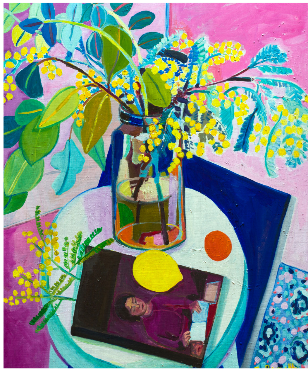
Above Keepsake 2020 oil on linen 76 x 66 cm