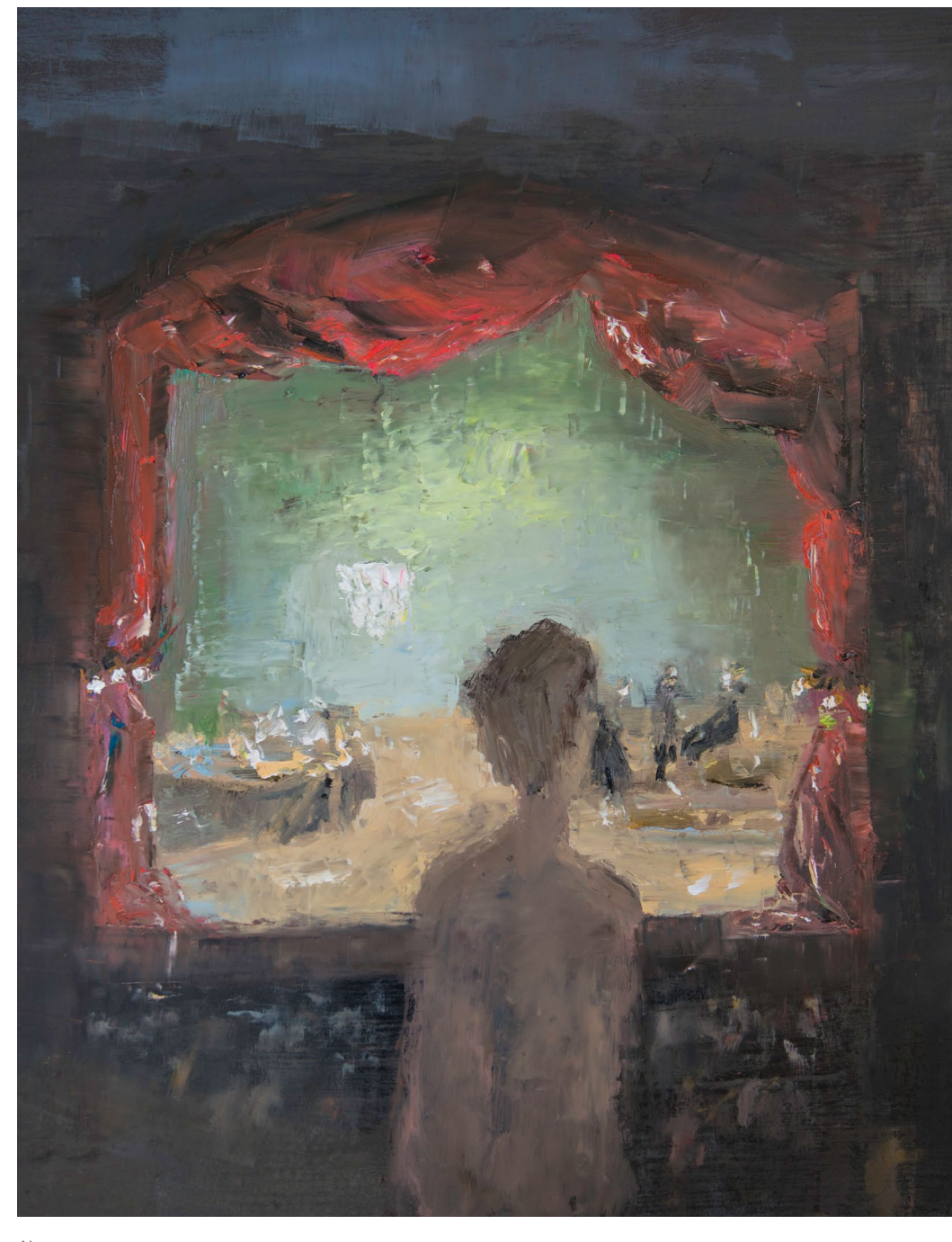
Above Head in the way 2018 Oil on board 50 x 50cm (Detail)