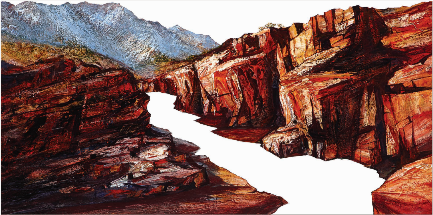
Above: Beyond Red 2014 acrylic on canvas 80 x 157 cm