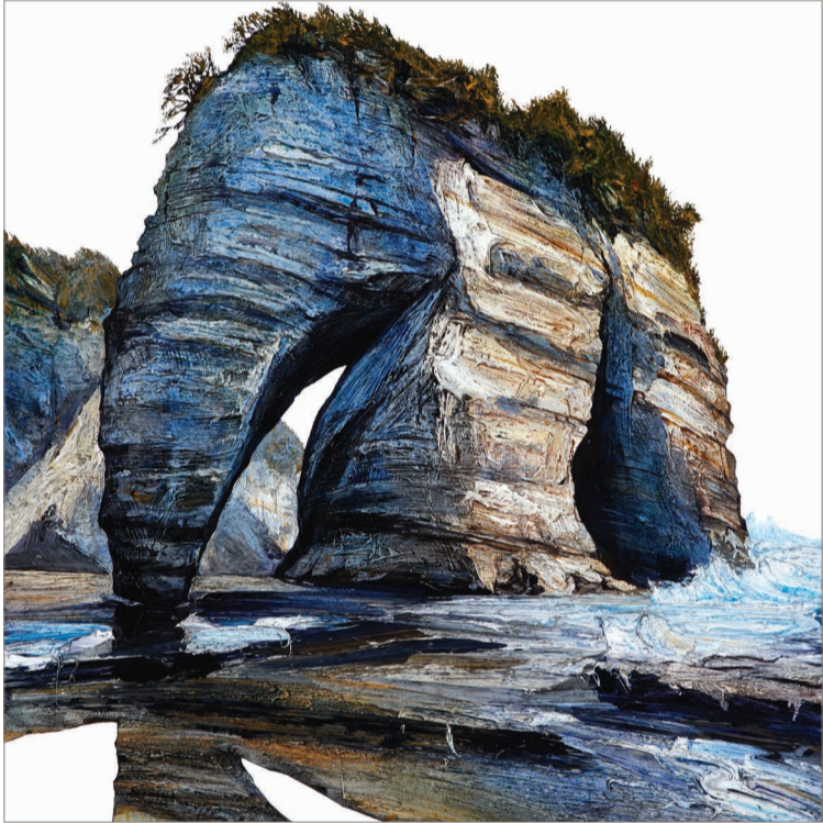
Above: Three Steps 2013 acrylic on canvas 110 x 110 cm