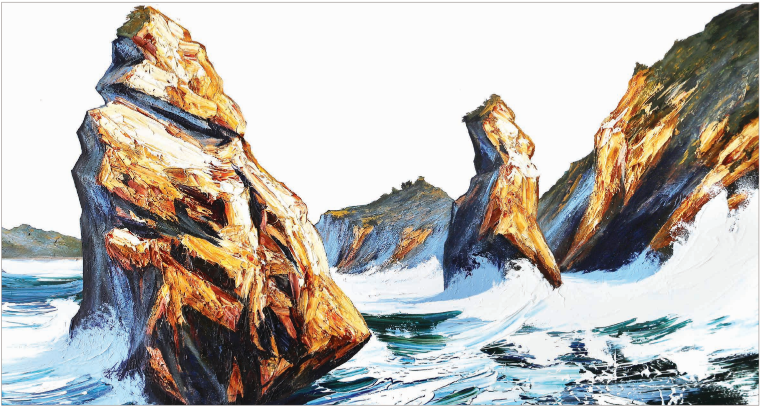
Cover: Swept Shore 2018 acrylic on canvas 195 x 295 cm