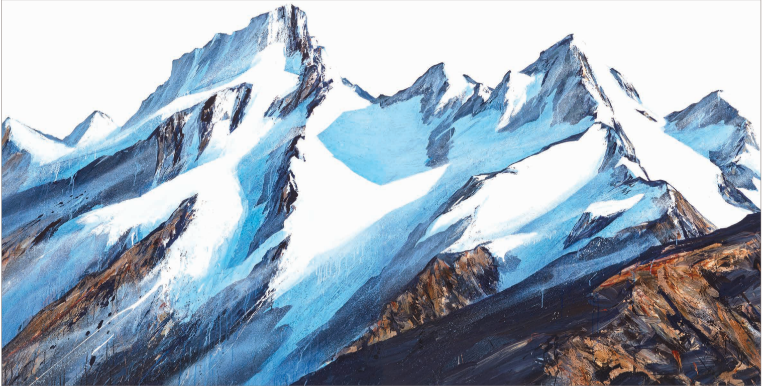
Above: Snow Drop 2017 acrylic on canvas 153 x 305 cm