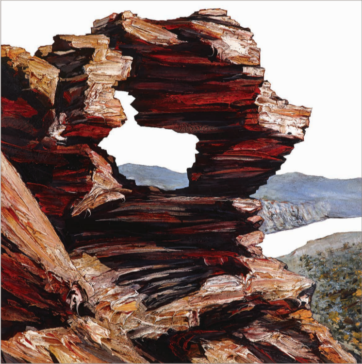
Above: Loop Twist study 2014 acrylic on canvas 137 x 137 cm